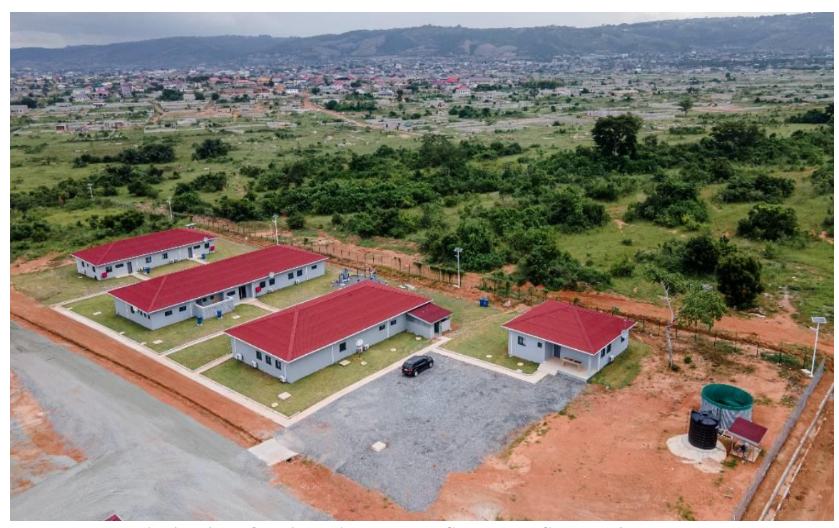
Aerial view of National Aquaculture Centre and Commercial Farms

To help reduce the overdependence on the marine sub-sector for domestic fish consumption and for export, Government aims to transform and grow the Aquaculture Sub-sector to increase domestic fish production, reduce fish import, and create jobs along the value chain. In line with the above stated goal, the Ministry completed the construction of the state-of-the-art National Aquaculture Centre at Amrahia, which was commission by H.E. the President, Nana Addo Dankwa Akuffo-Addo in June, 2023. The government supported the first batch of twenty-four (24) trainees made up of 12 males and 12 females to undertake thirteen (13) weeks training in various aspects of aquaculture including fish production, farm management, fish health, feed formulation, and processing. The second batch of 24 trainees are expected to graduate in December, 2023