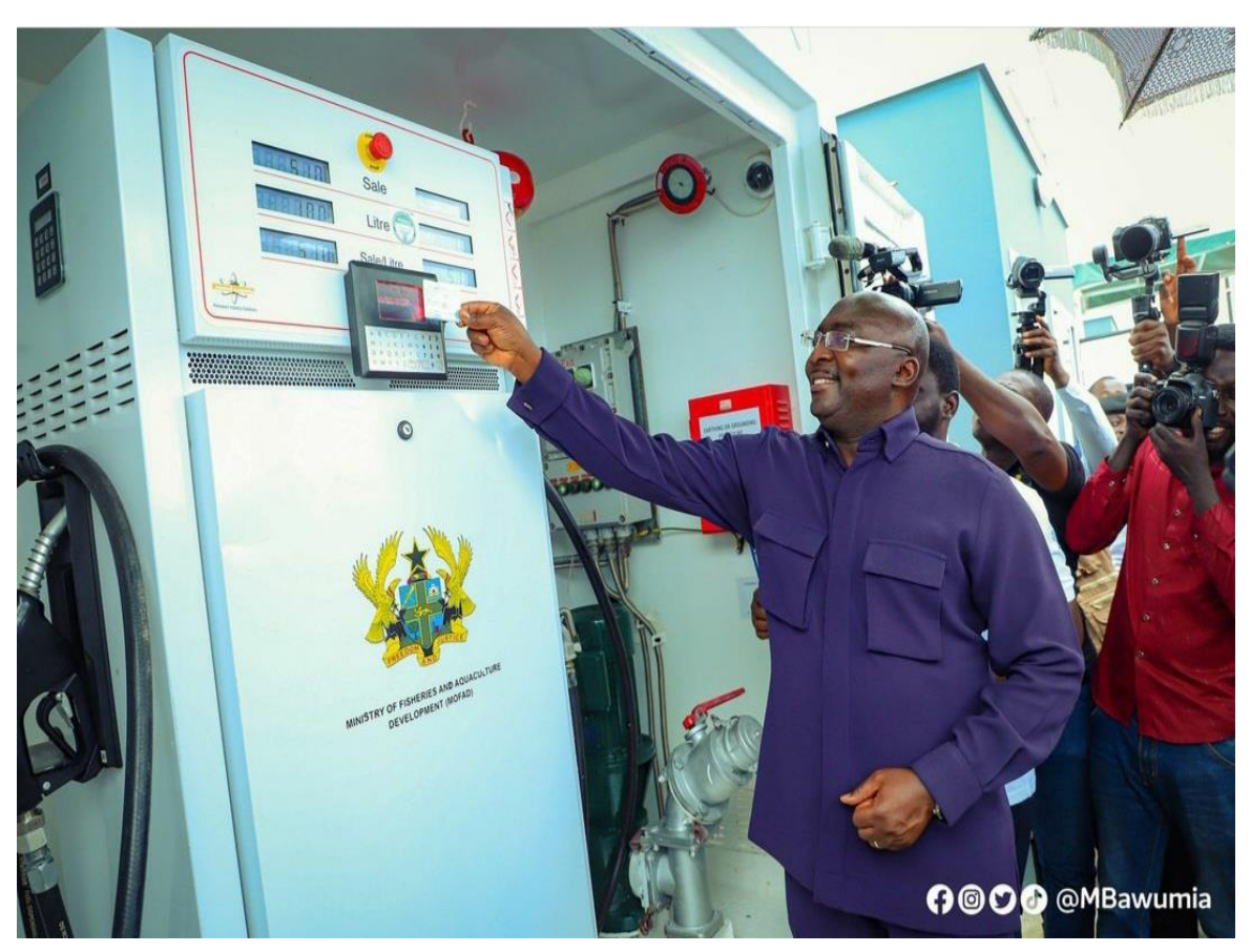
H. E. the Vice President operating the Automated Dispensing System