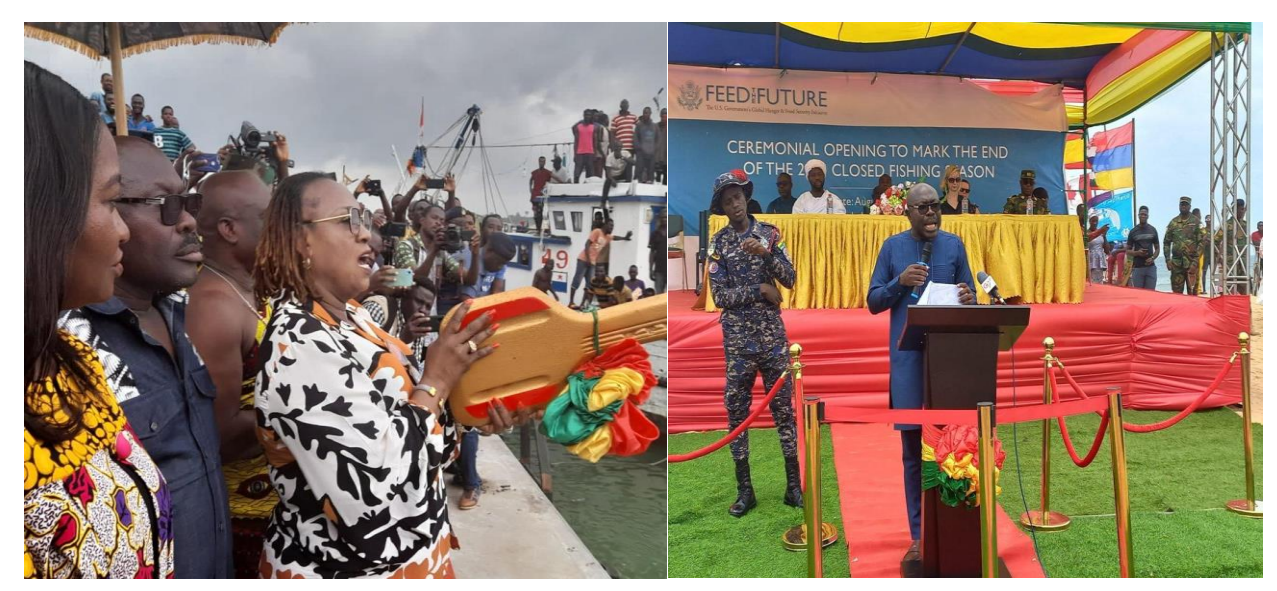
Closing and Opening of the Sea by Hon. Minister Hawa Koomson and Hon. Deputy Minister Mosses Anim

The Government of Ghana successfully implemented 2023 closed season for the artisanal, inshore, industrial trawlers and tuna fleets in 2023. The Closed Season, provided under Section 84 of the Fisheries Act, 2002 (Act 625) is a fish stock recovery strategy to help reduce the excessive pressure on marine fishery resources and replenish the dwindling fish stock. There was high compliance with the closure directives at all coastal fishing communities across the country which is an indication of the acceptance of the closed season as an important strategy to help replenish the marine fish stocks. To mitigate the adverse effect of the Closed Fishing Season on fishing communities, relief items and fishing input support comprising 20,000 bags of rice, 8,333 cartons of cooking oil, 3,000 wire mesh, and 10,000 aluminium basins were distributed to the fisher folks in the four coastal regions across the country. After successful involvement of Cote d'Ivoire, it is expected that our neighbouring countries such as Togo, Benin, Liberia and Nigeria will join the programme through the Fisheries Committee for the West Central Gulf of Guinea framework.