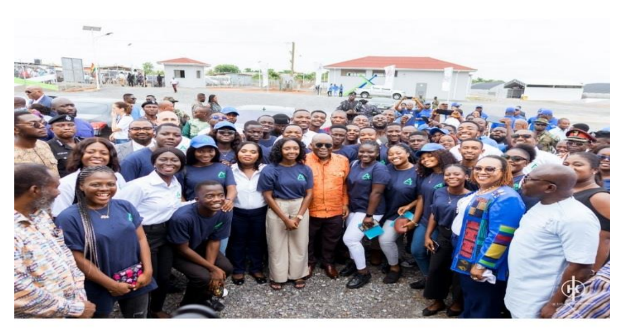
H.E. President & Hon. Minister with trainees during Commissioning Ceremony

Extension service delivery was provided to 5,349 existing and prospective aquaculture operators across the sixteen (16) regions to ensure compliance to good farm management practices.