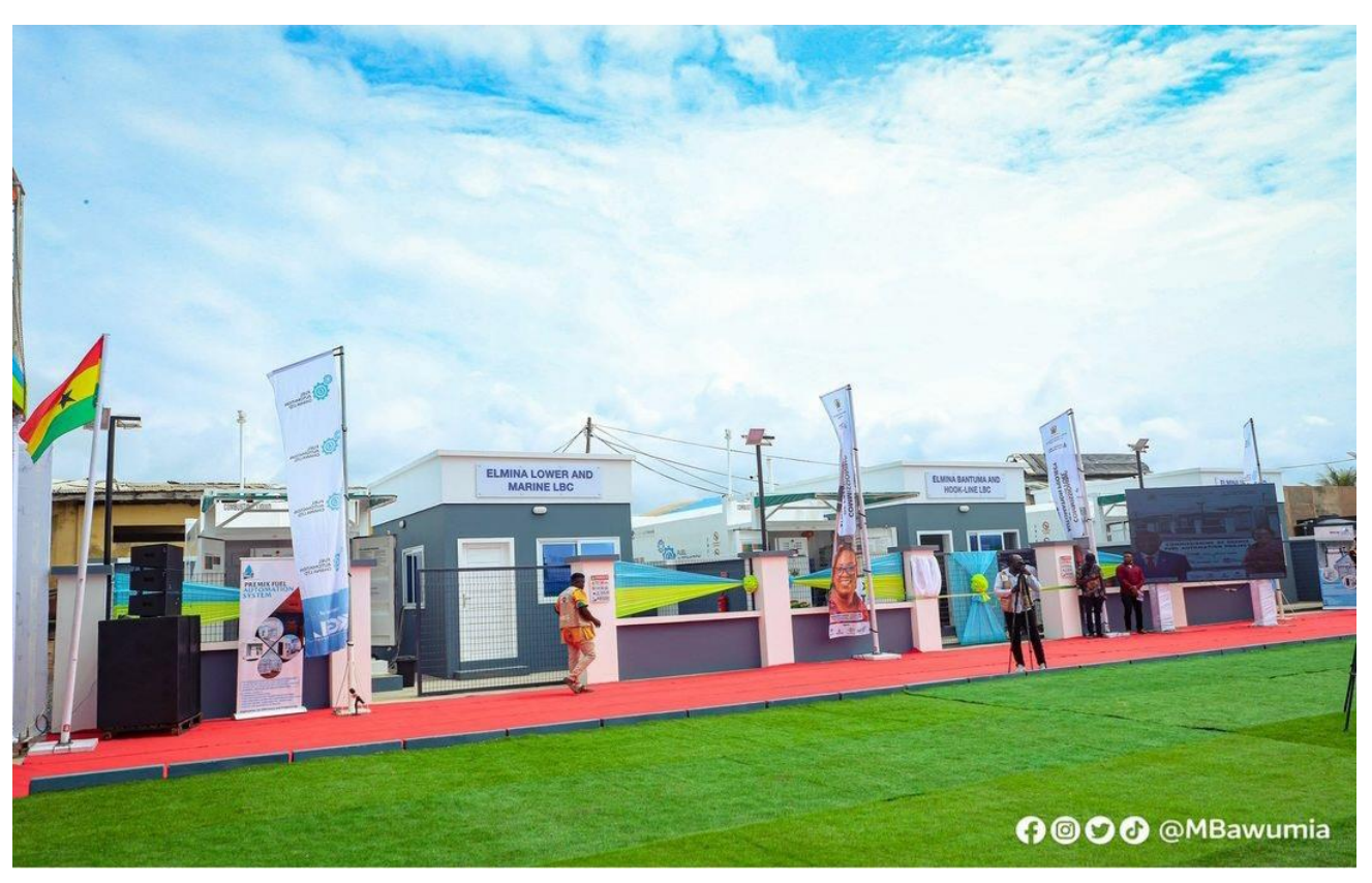
Elmina Automated Premix Fuel Dispensing System