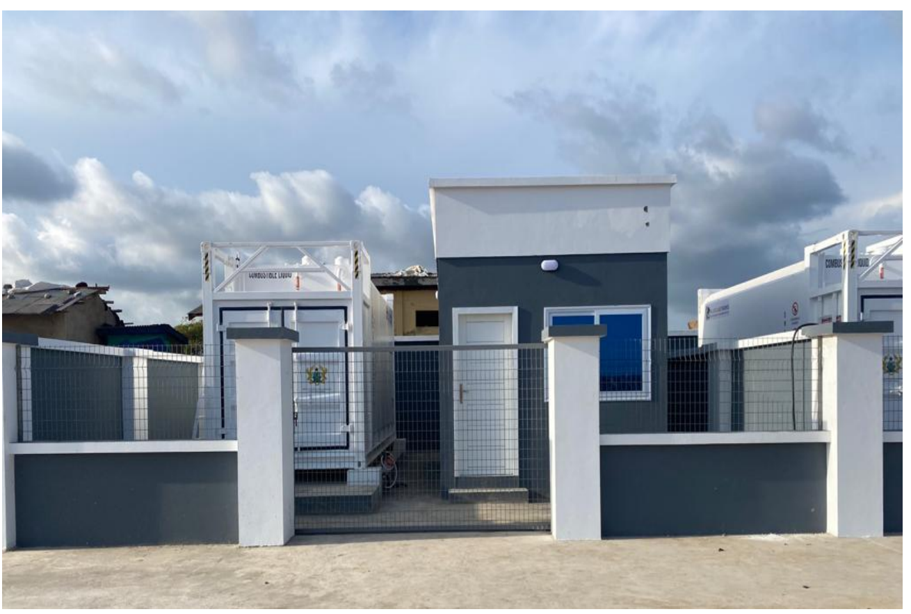
Automated Premix Fuel Dispensing System