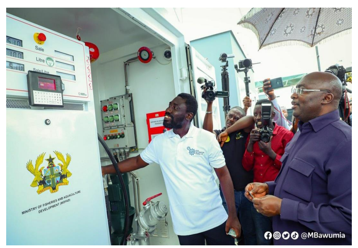
Commissioning of Dispensing System by H.E. the Vice President