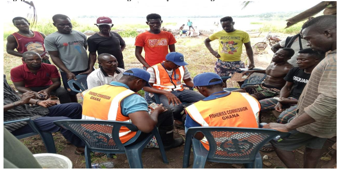
Collating Biodata of Inland Fishers

Engagement of fisherfolks from Prang community on canoe registration