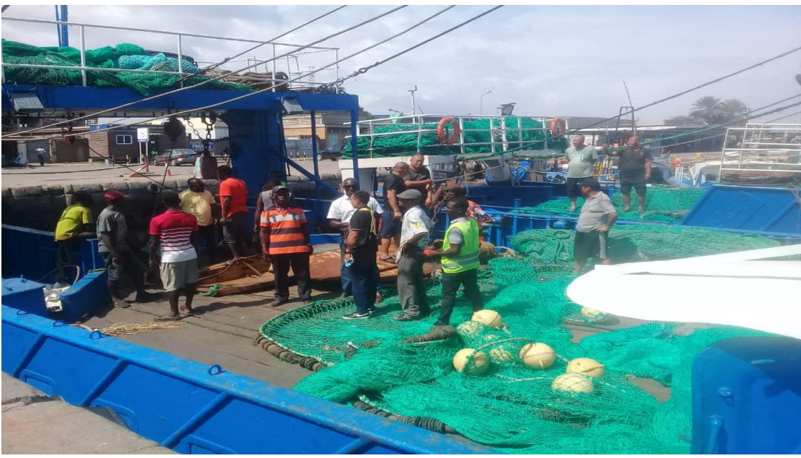
Pre departure Inspections of Trawl Gear by Hon. Minister