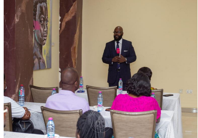
Training for GBC Regional Directors