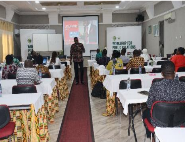
Training for PROs