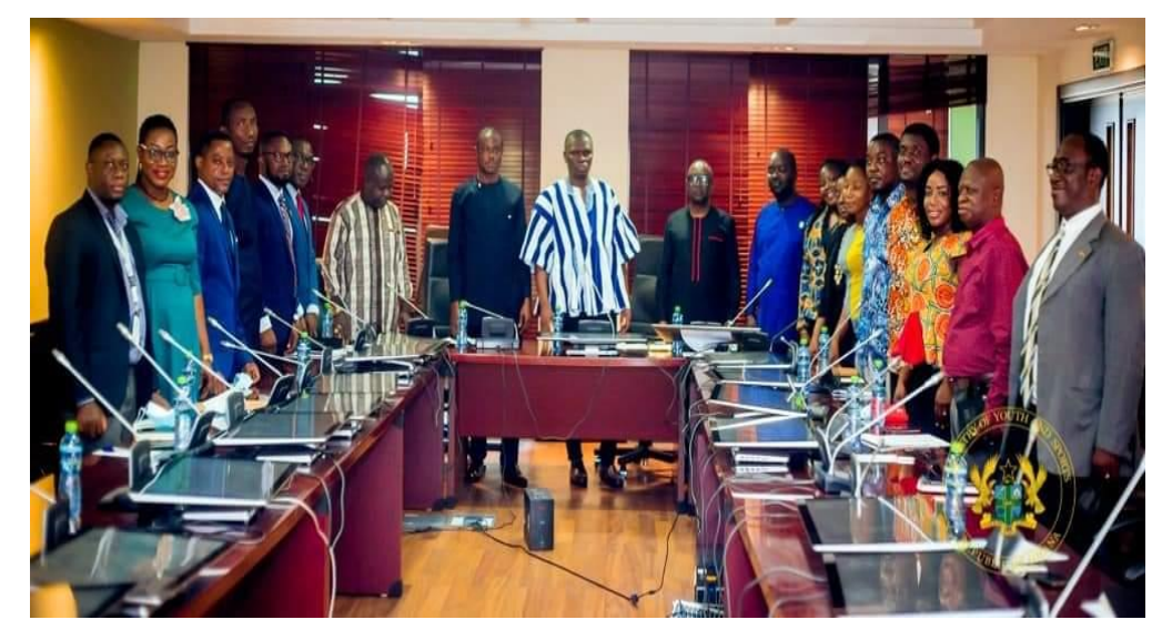
Inauguration of the YouthConnekt Africa 2021 Summit Committee

the attitudinal, structural and cultural processes. The summit created networks for businesses partnership, employment opportunities, jobs creation and young entrepreneurs.