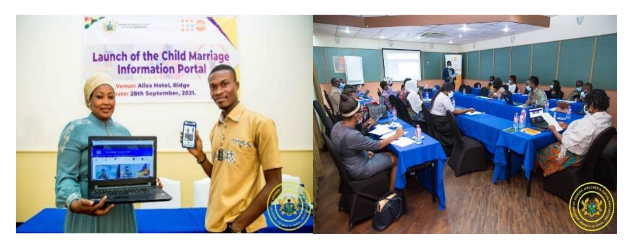
The 16 Days International Campaign against sexual and gender-based violence was marked to sensitize the public to act on issues of DV and Child Marriage.

The Domestic Violence Secretariat (DVS) through the Ministry launched Ghana's first ever Domestic Violence Information Portal (DVIP) on Tuesday, 28th September 2021 to provide and enhance data sharing amongst all stakeholders in the fight against Domestic/Sexual and Gender-Based Violence and Child Marriage. A training session was also conducted for its staff on the management of the portal.