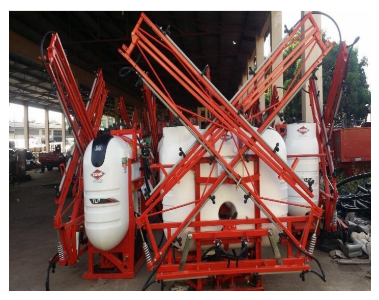
Mounted Boom Sprayers