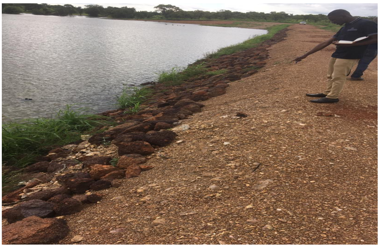
Completed Small Earth Dam at Degri in the Upper West Region