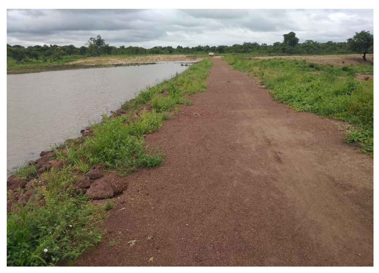
Completed Small Earth Dam at Kataa in the Upper West Region