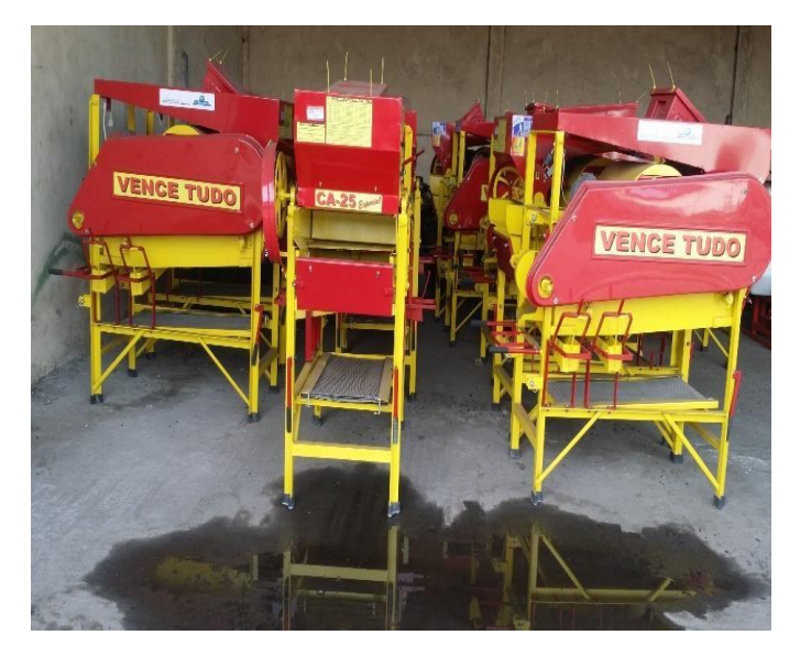
Seed Cleaner and Sorter