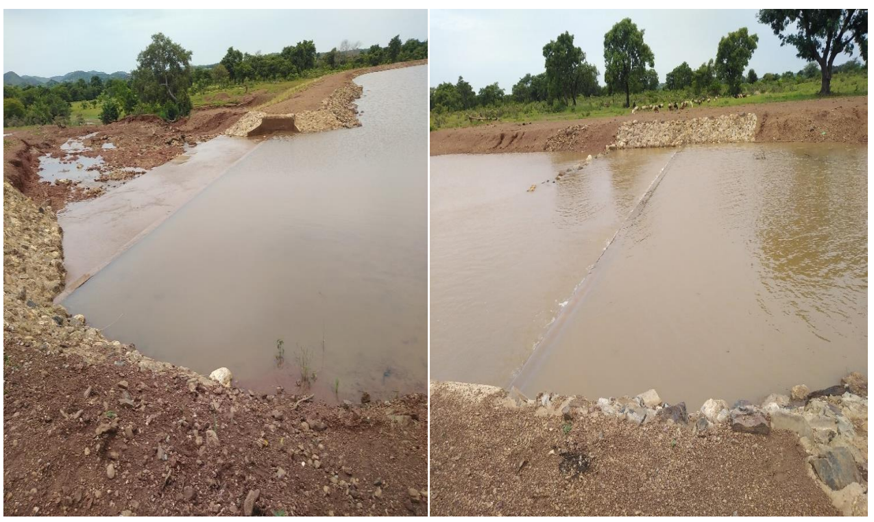
Spillways of Small Earth Dam at Namolgu in the Upper East Region