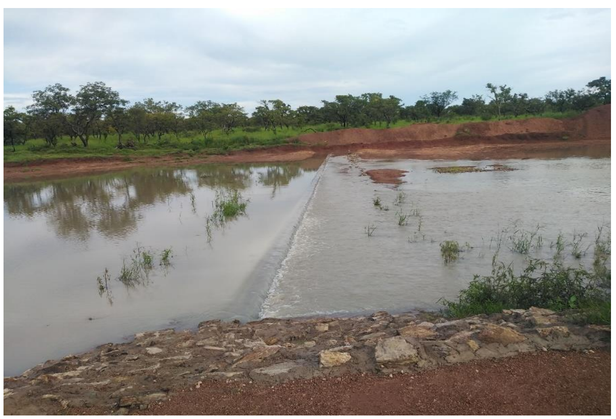
Spilling of completed Small Earth Dam at Duong in the Upper West Region