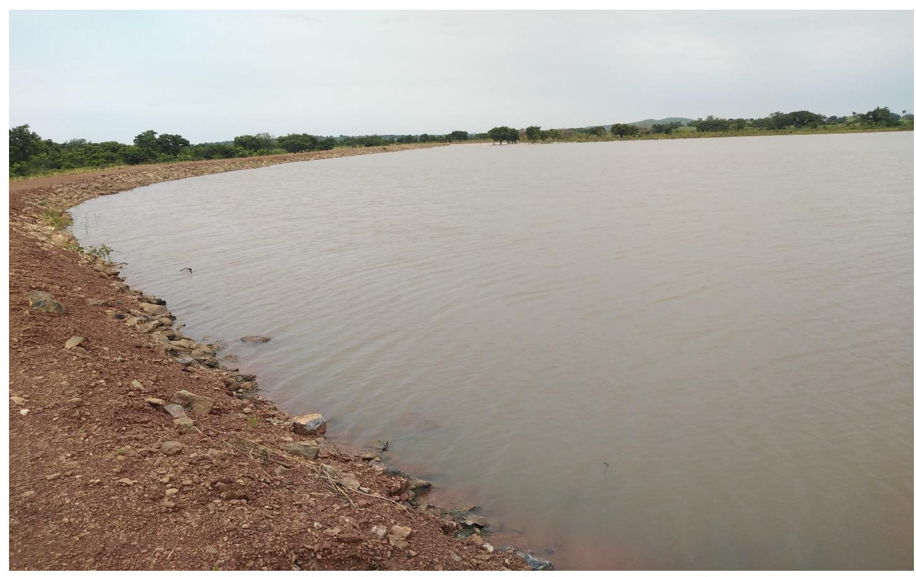
Completed Small Earth Dam at Namolgu in the Upper East Region