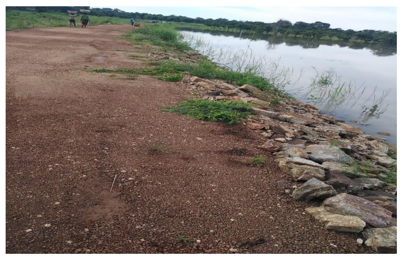
Completed Small Earth Dam at Duong in the Upper West Region