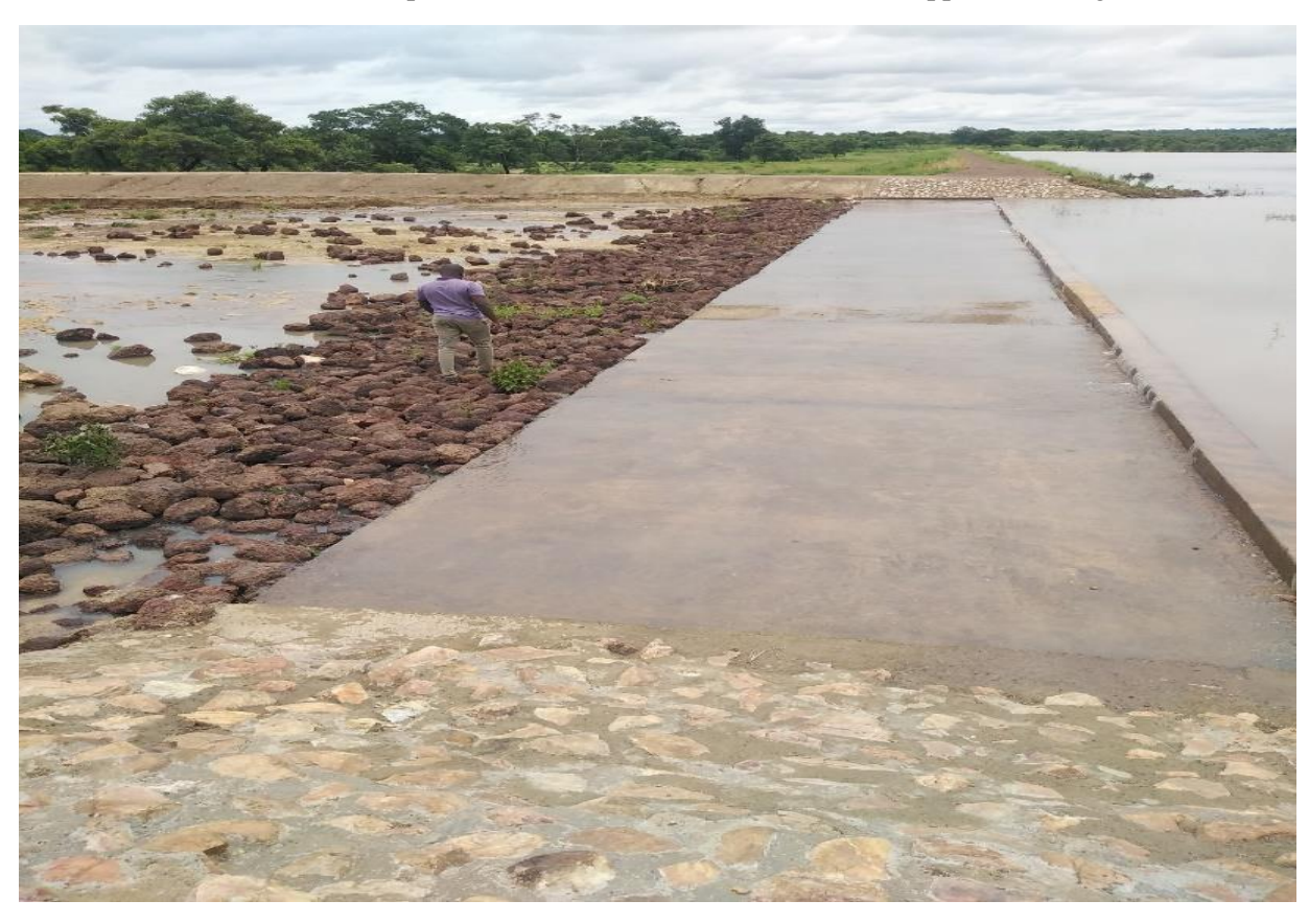
Spilling of completed Small Earth Dam at Kataa in the Upper West Region