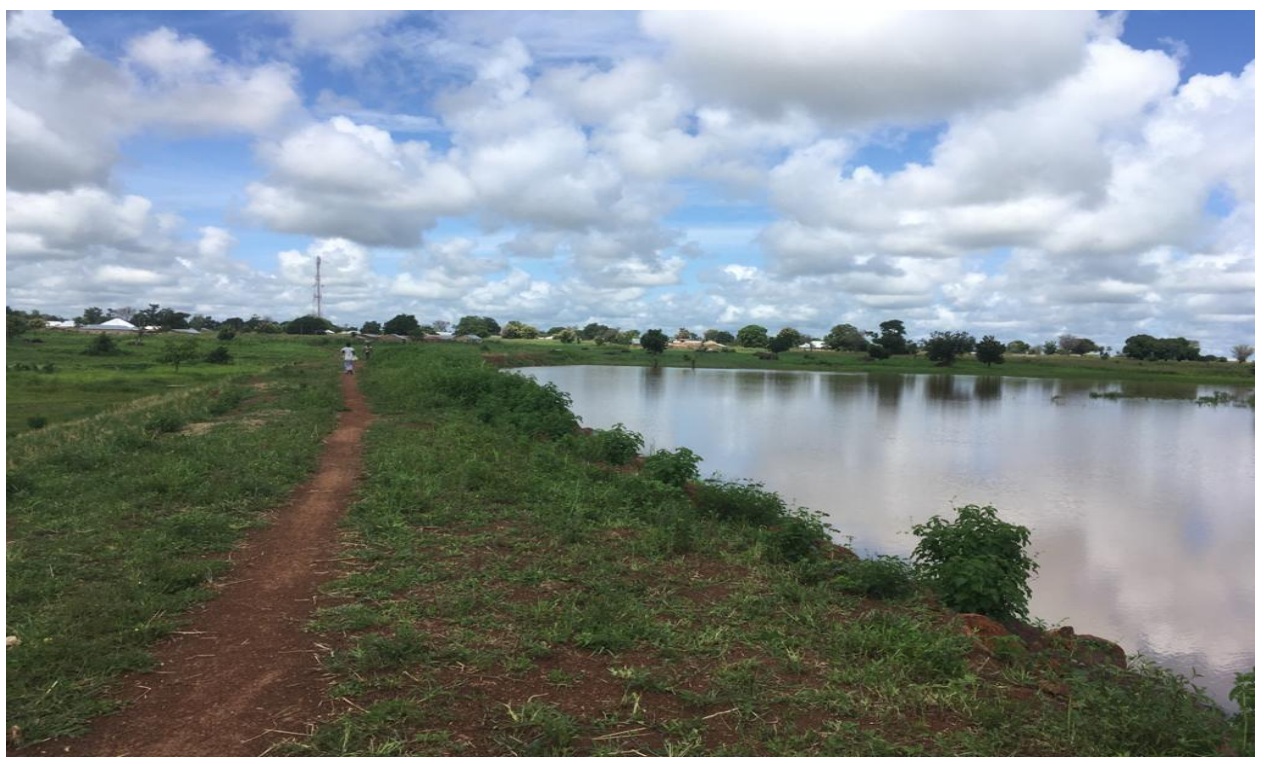
Completed Small Earth Dam at Tuopare in the Upper West Region