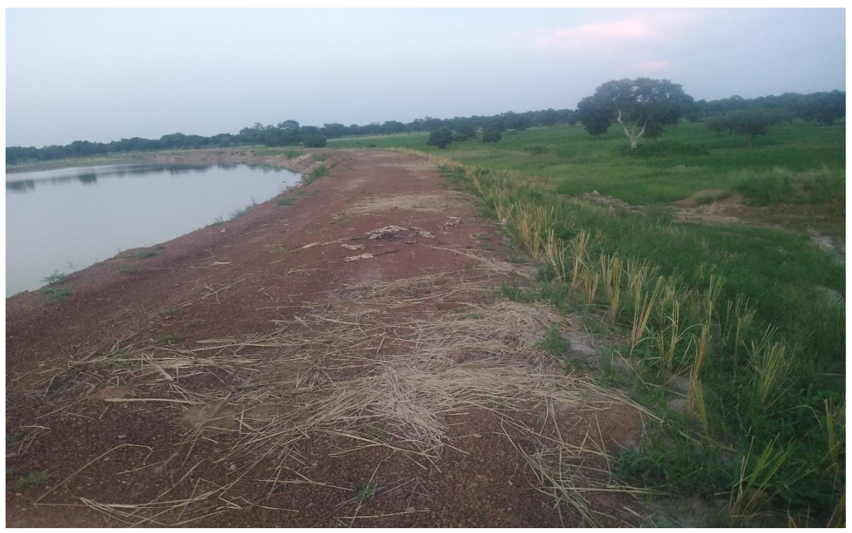
Completed Small Earth Dam at Vunania in the Upper East Region