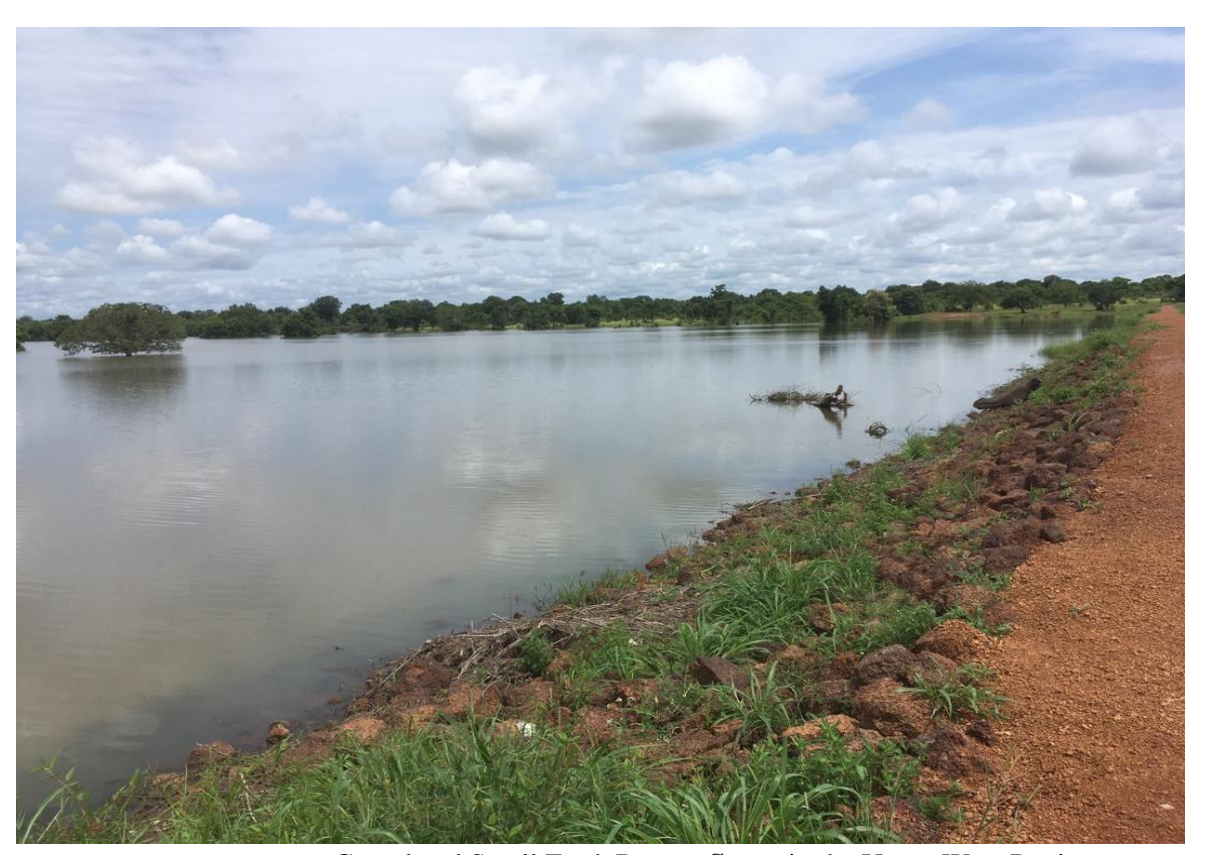
Completed Small Earth Dam at Sentu in the Upper West Region