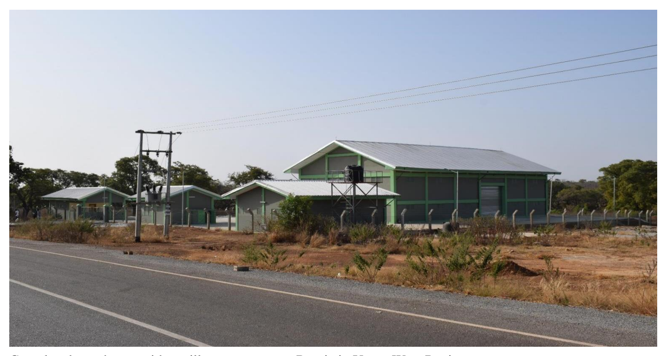
Completed warehouse with ancillary structures at Bussie in Upper West Region