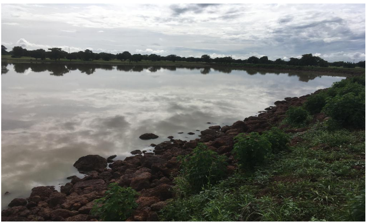
Completed Small Earth Dam at Tokun in the Upper West Region