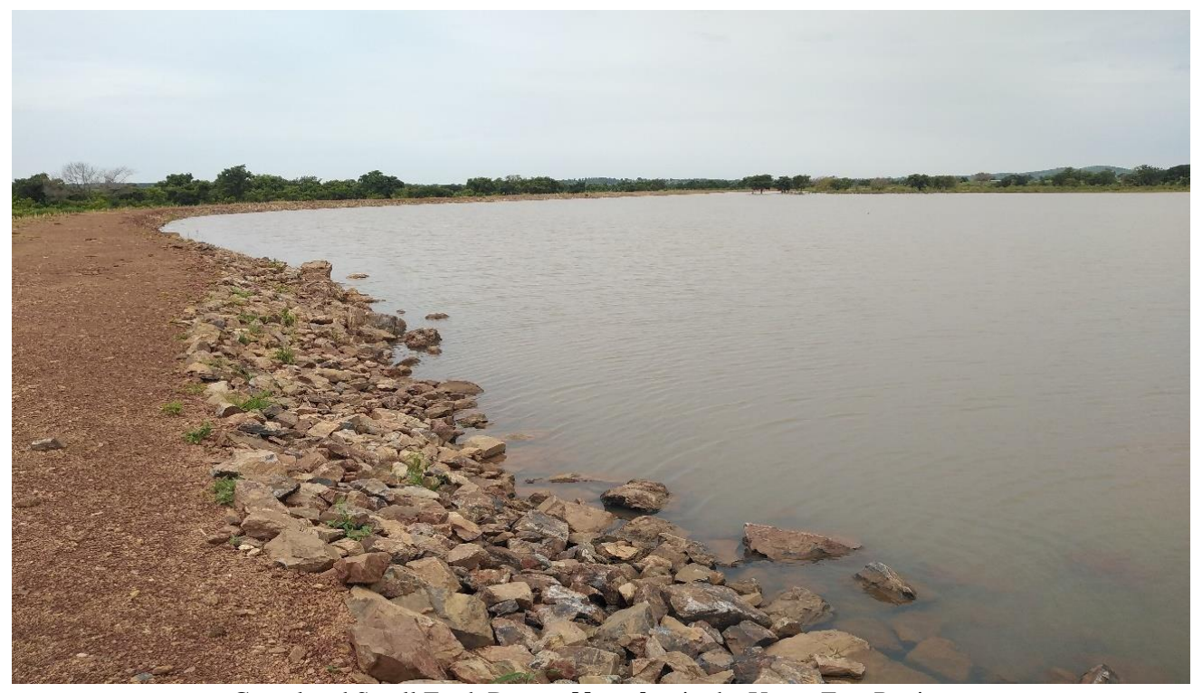
Completed Small Earth Dam at Namolgu in the Upper East Region