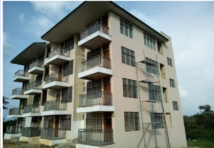
. Border Patrol Residential Accommodation at Dadieso