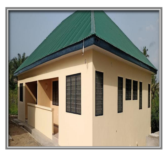
2 BEDROOM SEMI DETACHED FOR FEMALE POLICE OFFICERS AT AMPAIN