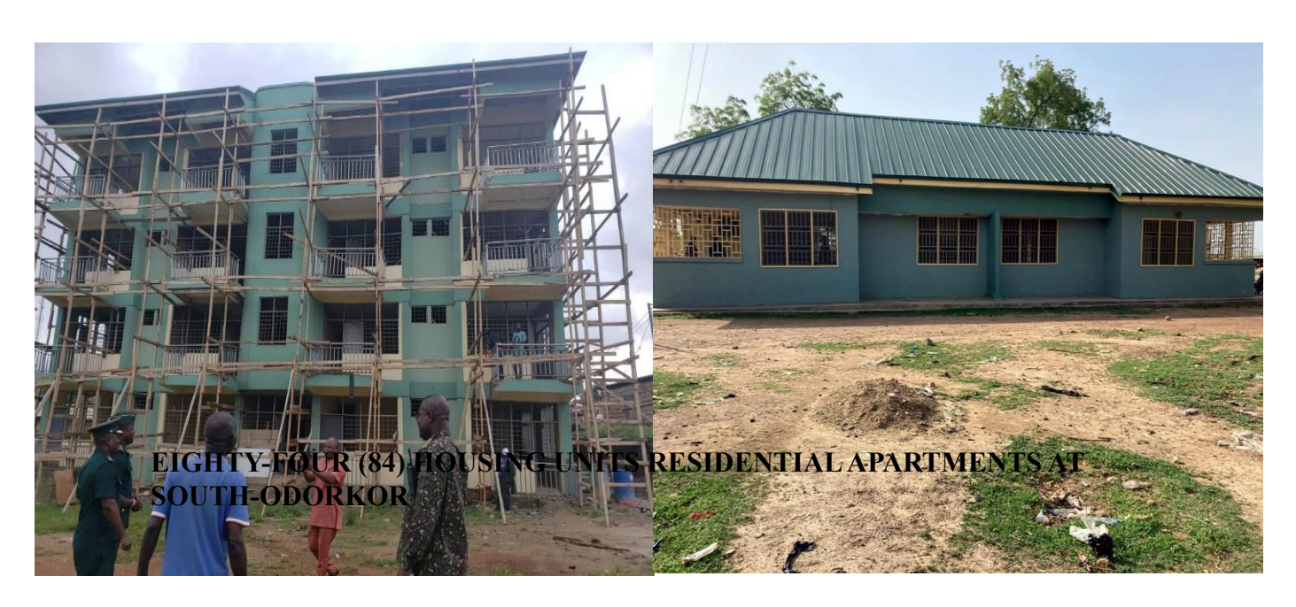
Border Patrol Residential Accommodation, Elubo