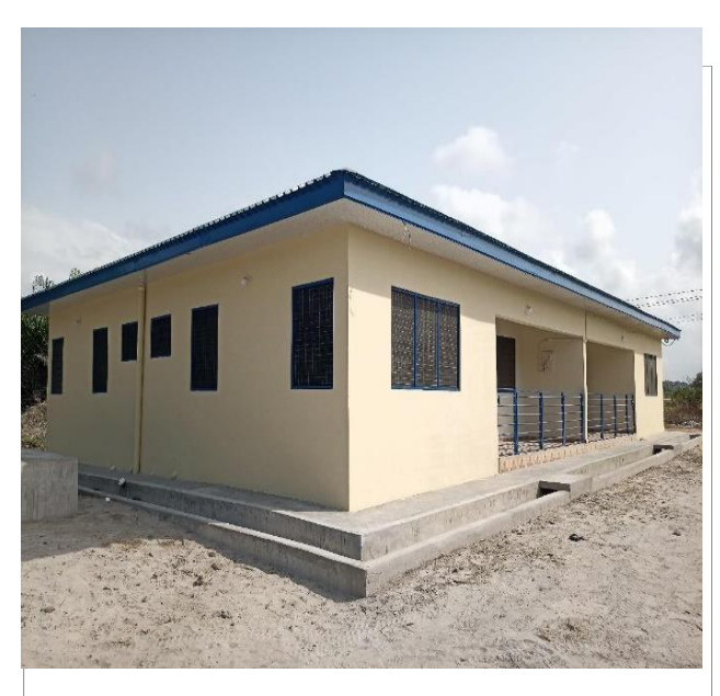
2-bedroom semidetached apartment for Female police quarter at Krisan