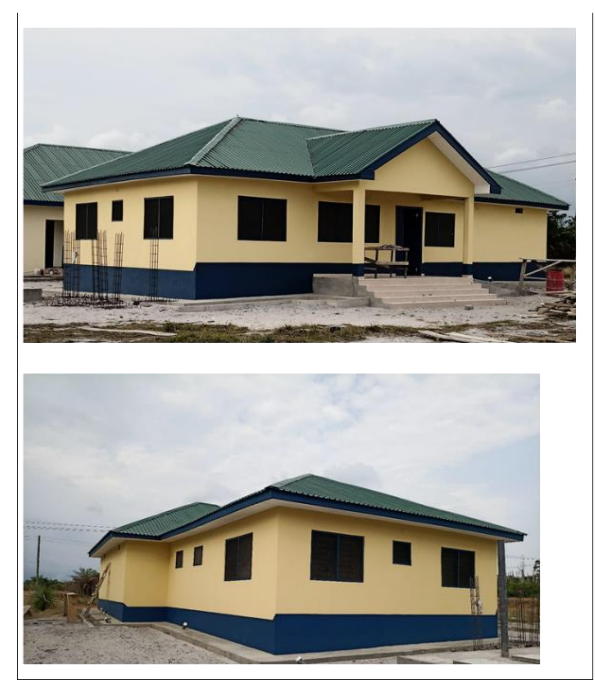
Police station at krisan

Krisan Camp; Construction of 2-bedroom semidetached apartment for female police officers, police station, Police station officers' quarters, renovation of nursery with provision of hexagonal tables and chairs, Library & ICT Laboratory.