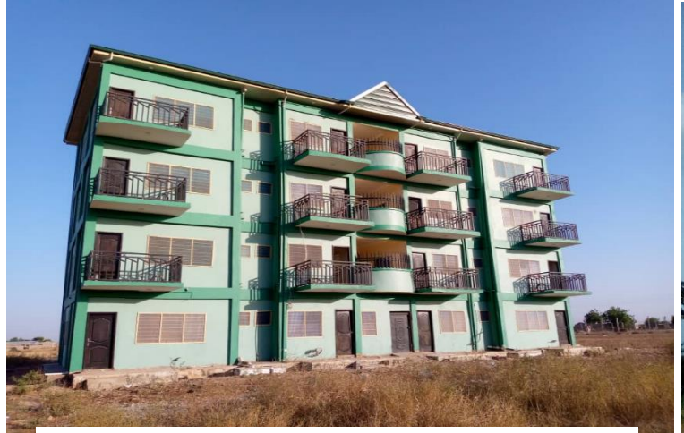
Border Patrol Residential Accommodation at Bawku, Upper East Region