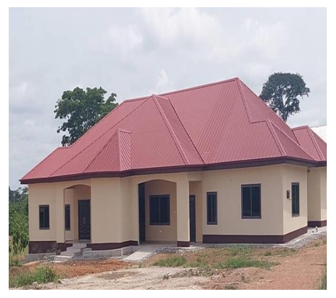
2-bedroom semi-detached for Lab technician and Psychosocial nurse

Ampain Camp: Construction of COVID Isolation Centre, 2-bedroom semidetached apartment for female police officers, Police station officers' quarters, Market (40 open/10 lockable).