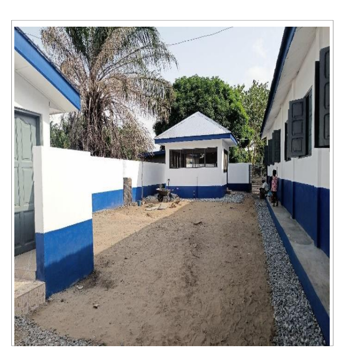
Library and ICT Lab at Krisan