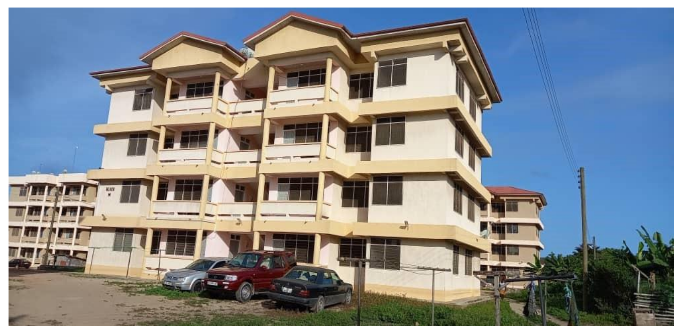
STAFF ACCOMMODATION COMPLETED AT ANKAFU

• 2 bedroom 4-storey flats completed and handed over at Ankaful.