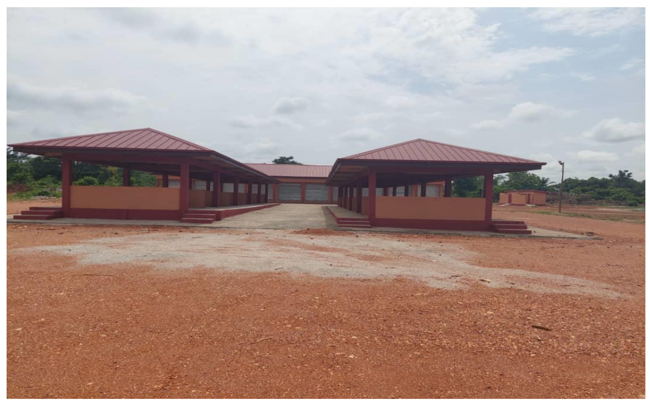
Market shed and lockable stores