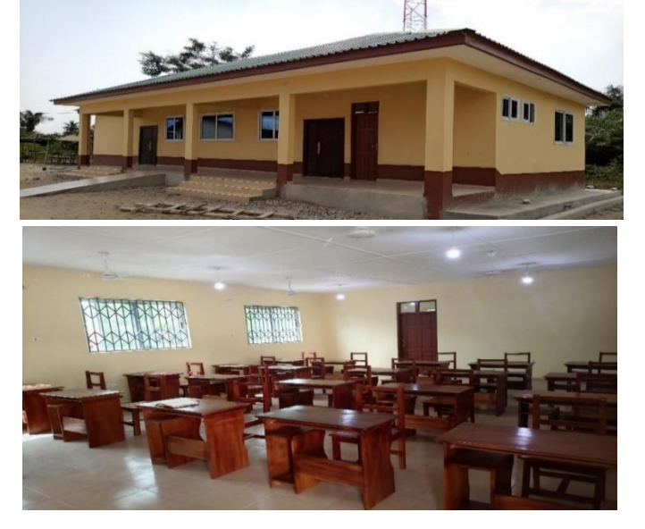
Renovation of nursery School at Krisan