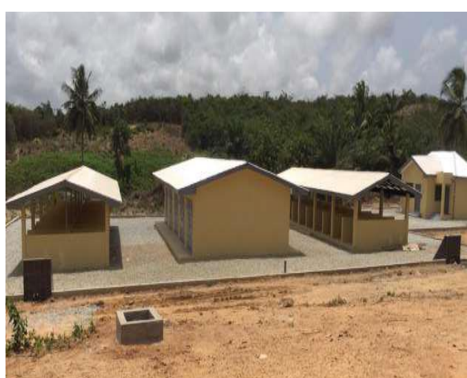
4 Unit KG & Kindergarten Block at Egyeikrom . \, 40 unit market shed with lockable stores