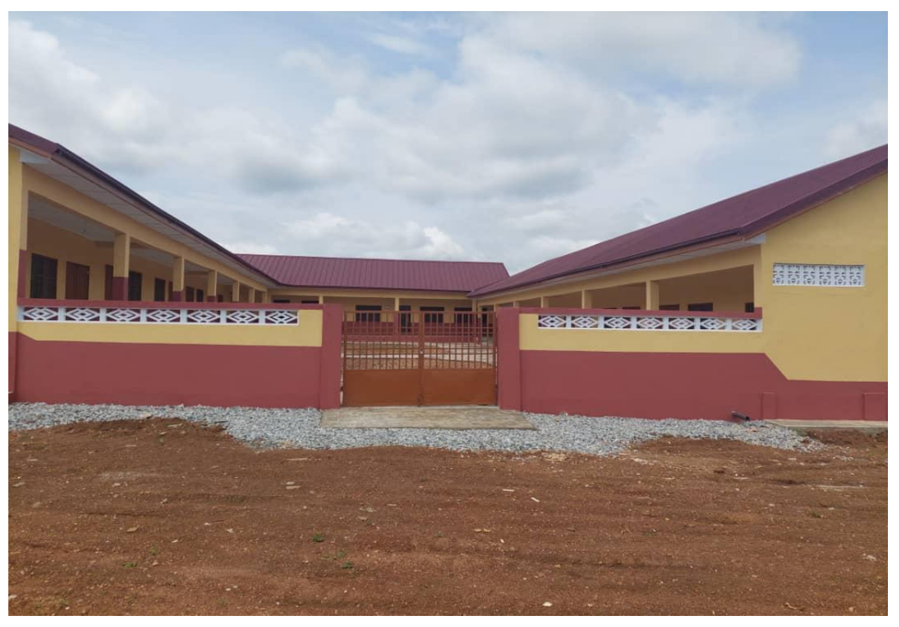
6-Unit class room block