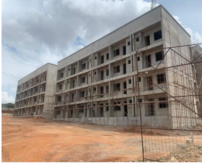
Construction of 320 housing units comprising 7 No. 2 - Bedroom and 13No