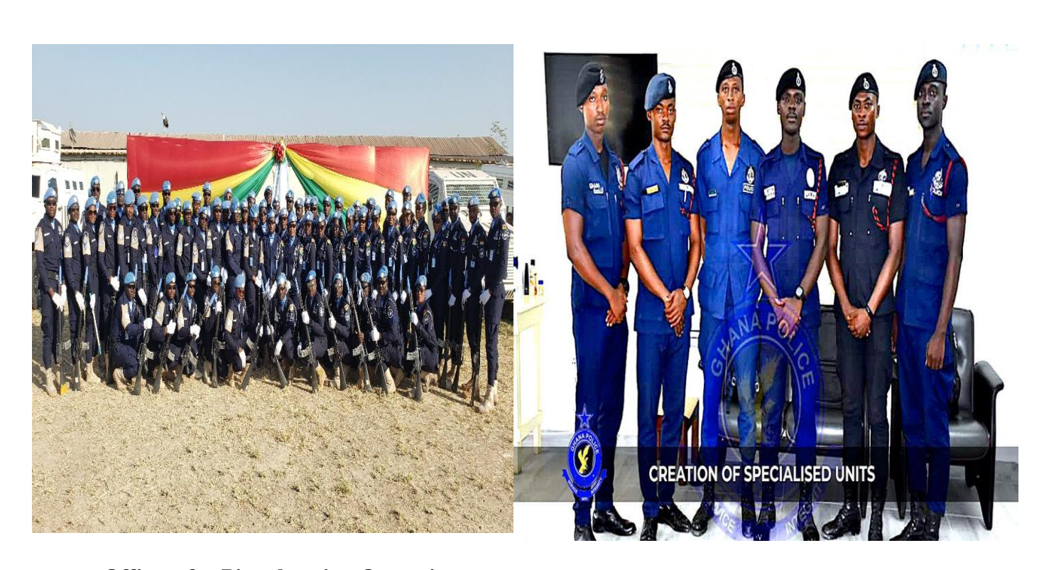
Officers for Piece keeping Operations