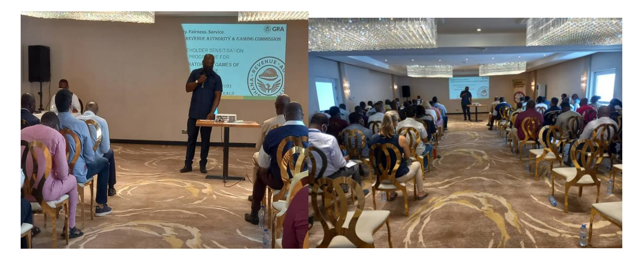
GRA & Gaming Commission Stakeholder Meeting