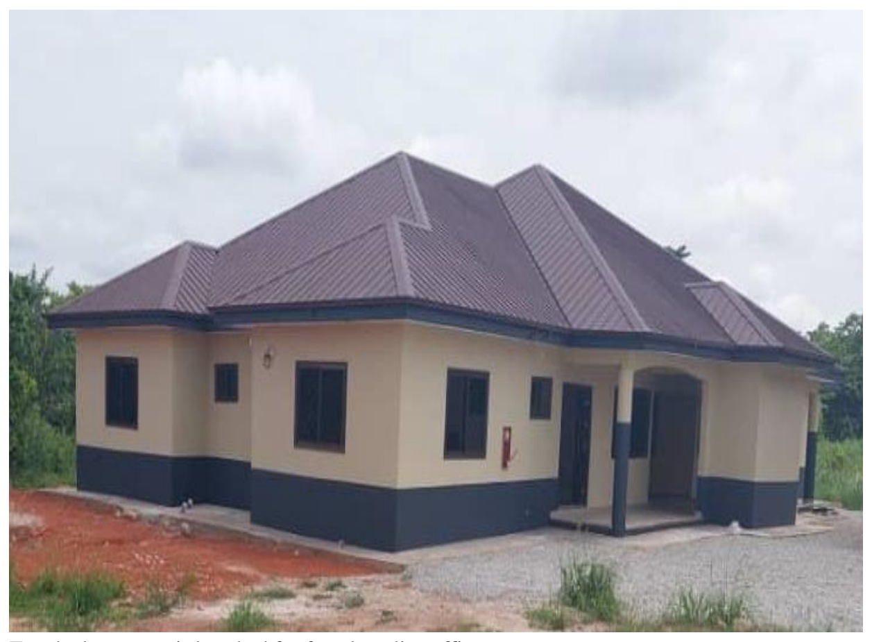
Two bedroom semi-detached for female police officers