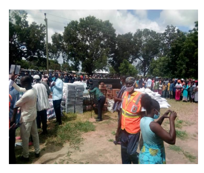
North East: Pictures from Bagbini - West Mamprusi Municipal, Walewale