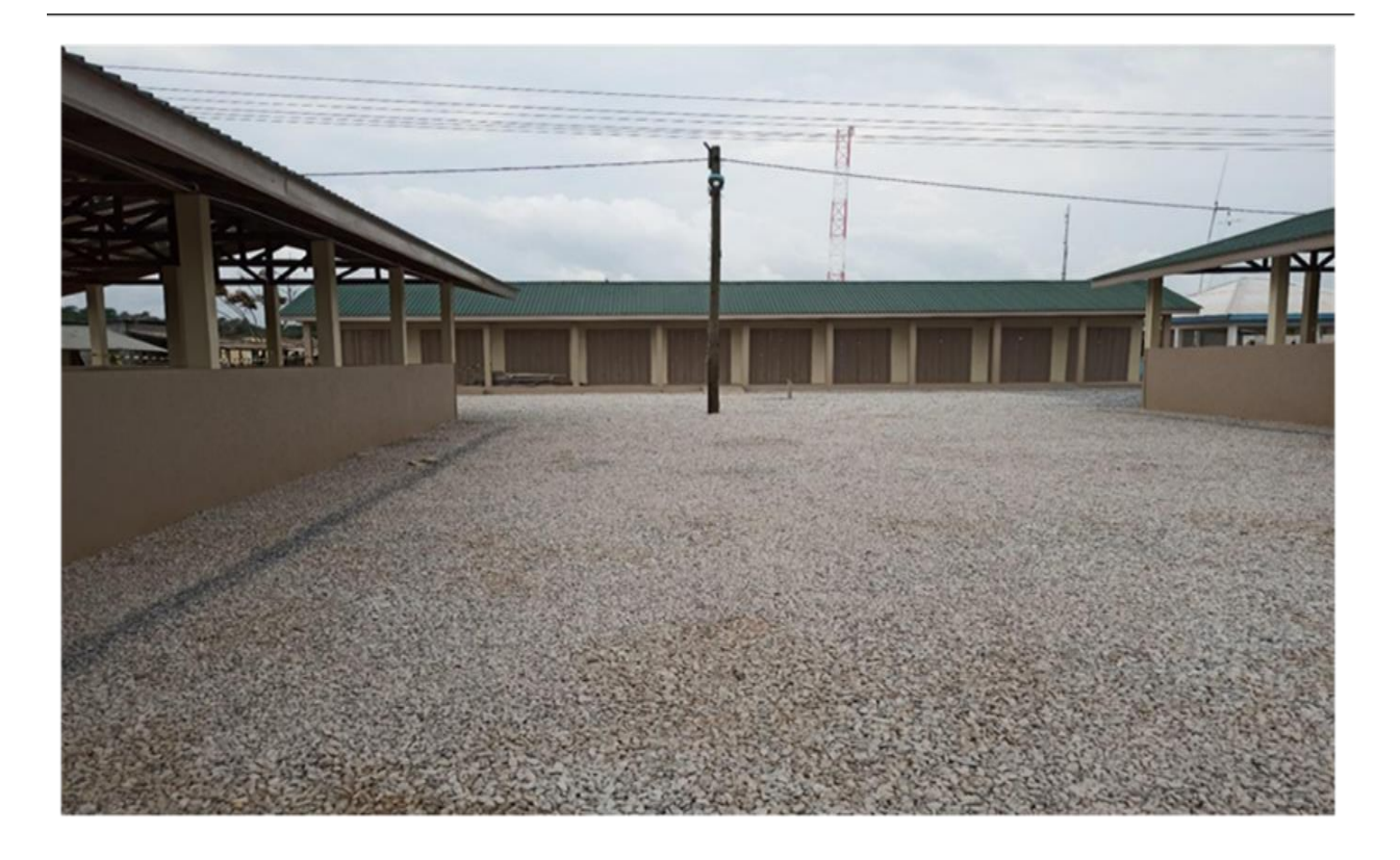
40-unit open market shed with 10 lockable stores