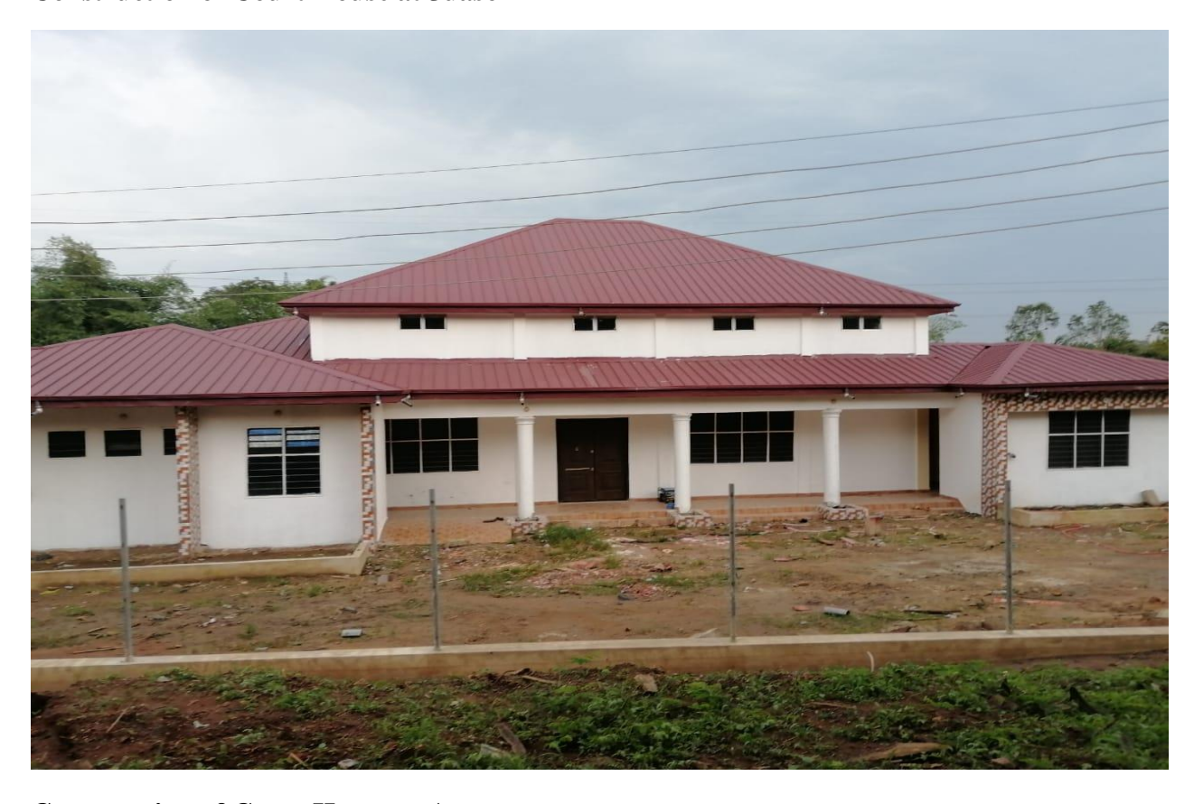
Construction of Court House at Atasemanso