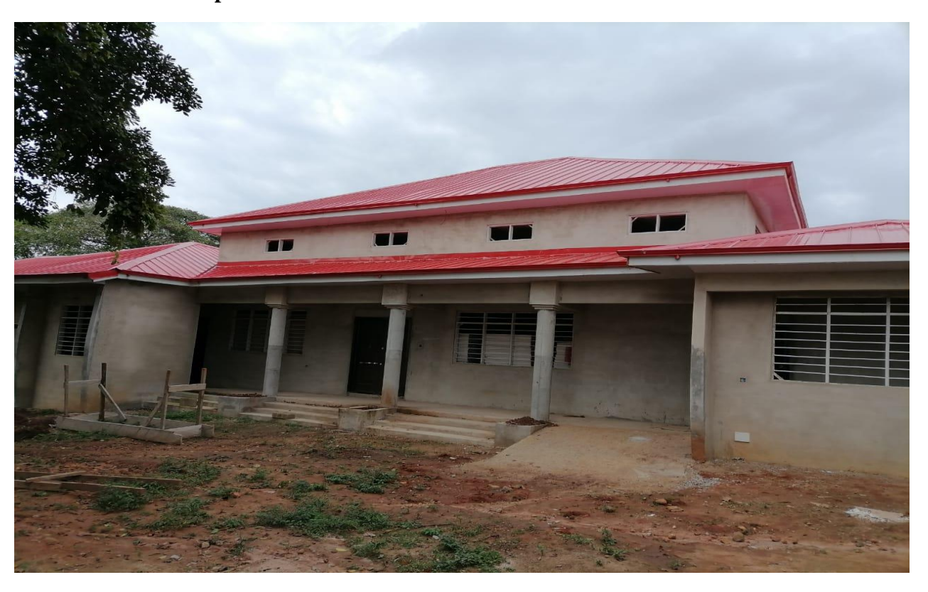
New Court House at Somanya