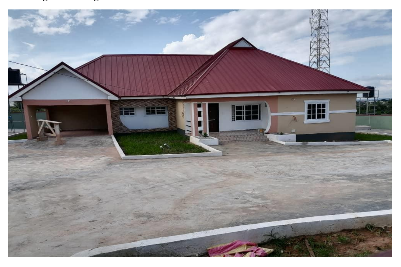
Court House at Pakyi No.2