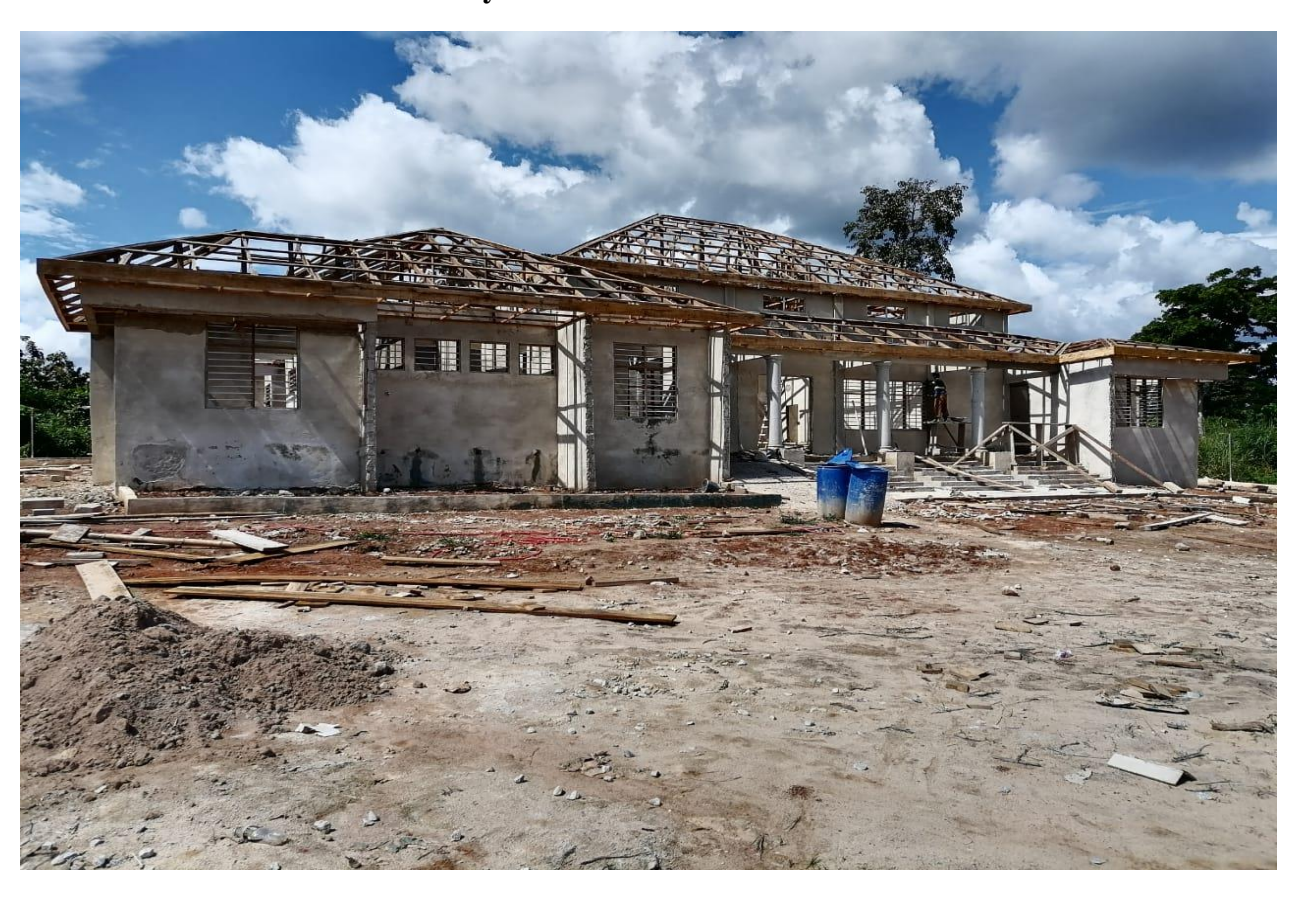
Construction of Court House at Ofankor, Accra