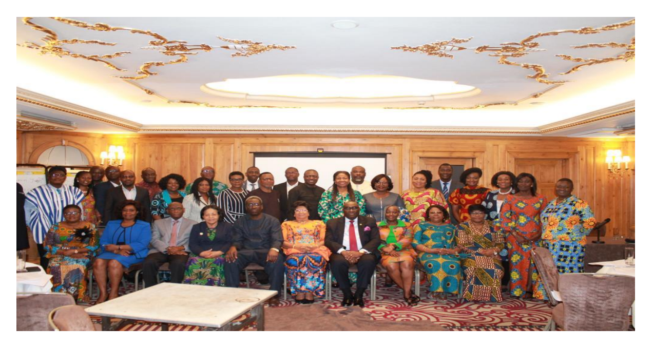
HOMs/A1 OFFICERS SIGNING IN THE UK

As at the end of August, thirty-four ( 34 ) Chief Directors and two hundred and eight ( 208 ) Directors/Heads of Department had signed Performance Agreements for 2019. Also, forty-eight ( 48 ) Heads of Missions signed with the Chief Director and endorsed by the Minister of MoFARI and the Head of Civil Service. Fifty-eight ( 58 ) A1 Officers and 7 Consul Generals signed with the Heads of Mission and endorsed by the Chief Director.