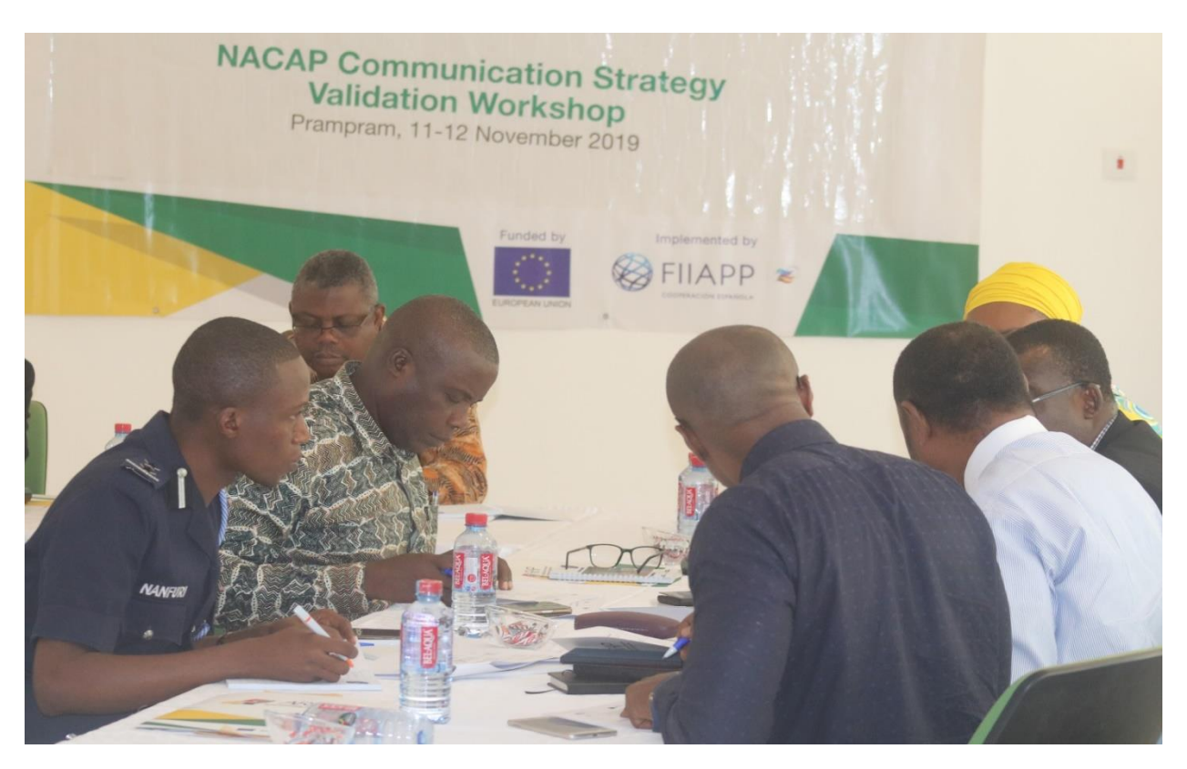
Communication \ Strategy \ validation \ Workshop - NACAP