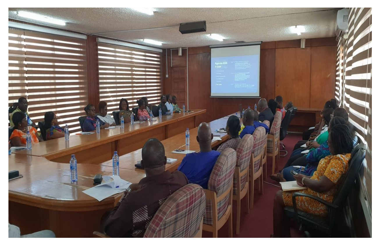
Sensitization on SDG – Organized for CHRAJ Staff