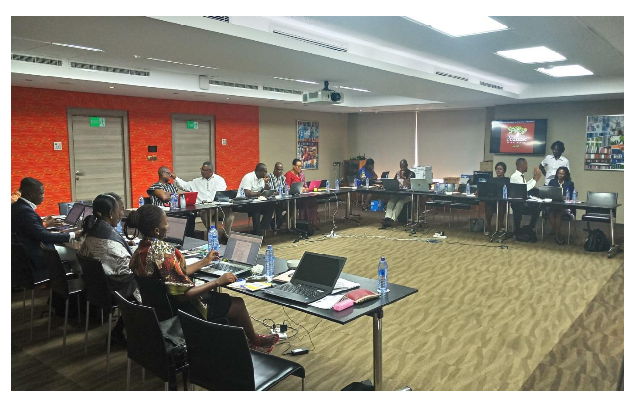
NACAP ARP Writing