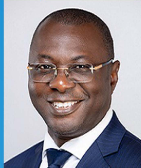
Hon. Mohammed Amin Adam Minister of State