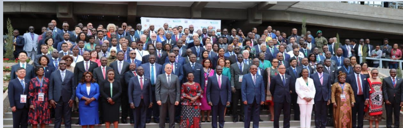
High-level Opening of the Ministerial on Climate Change