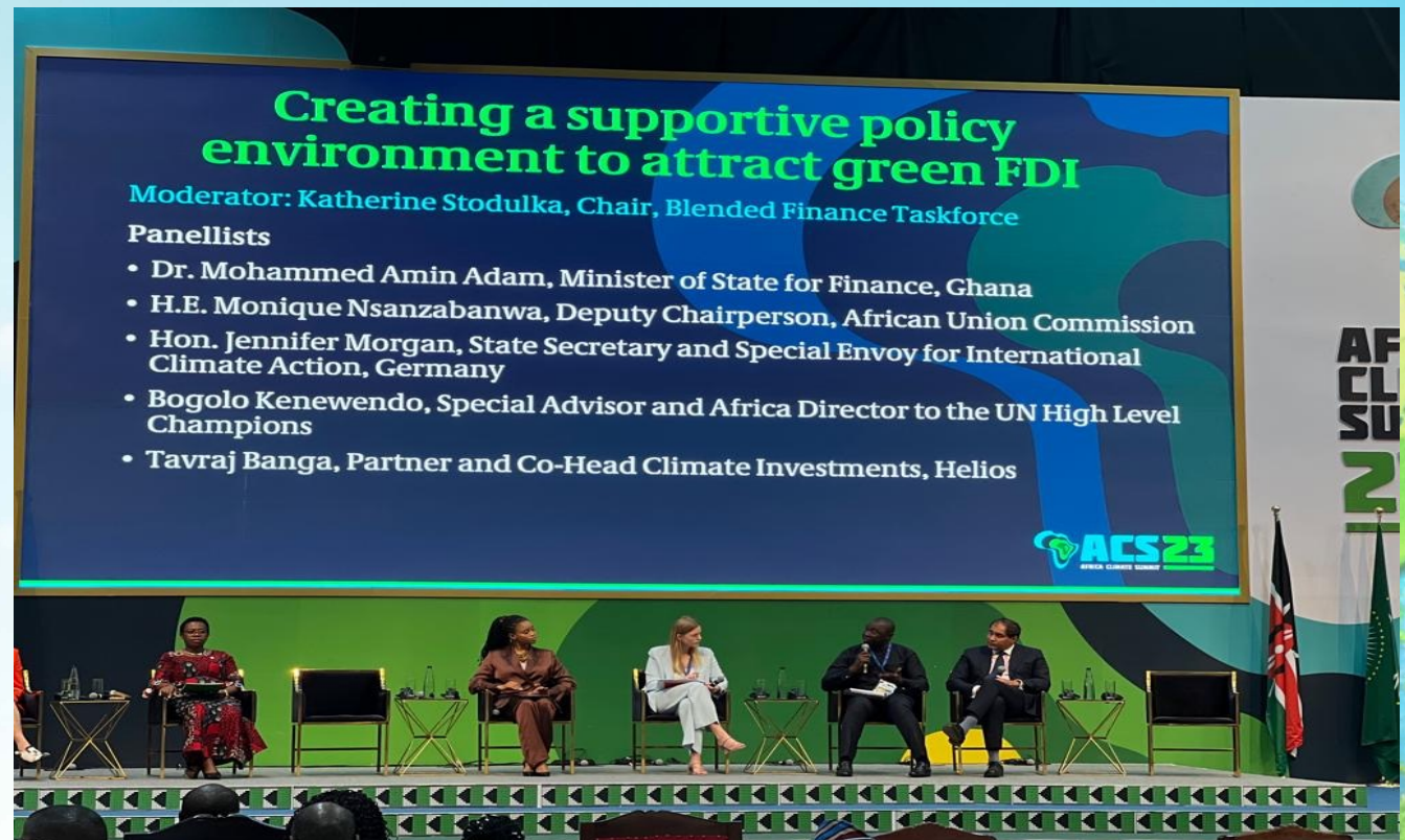
Hon. Minister of State stressing on the need for policies that supports FDIs

Speaking at the Summit on the topic Creating a Supportive Policy Environment to Attract Green Foreign Direct Investment, Dr Amin noted that policy consistency was an essential element in the continent's pursuit of investment financing.