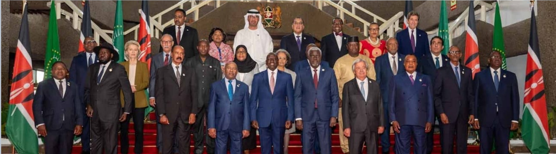
Ministers from relevant sectors, finance, energy, environment, and agriculture; heads of UN agencies; development partners, the private sector, philanthropies, civil society, women and youth attended this session.