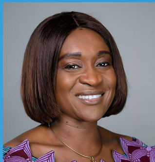
Hon. Abena Osei Asare Deputy Minister (MP)