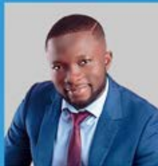
Hon. Dr. Alex Ampaabeng Deputy Minister (MP)