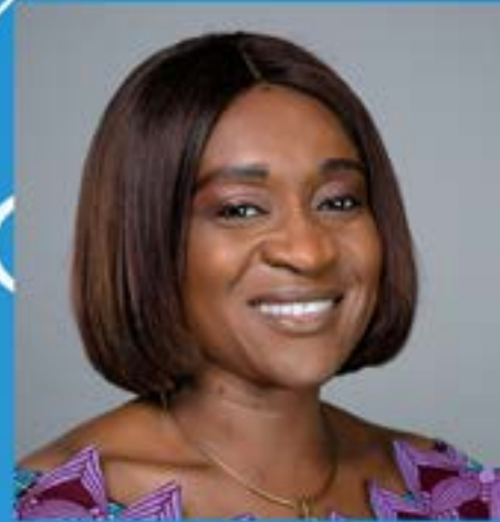
Hon. Abena Osei-Asare Minister of State, Finance