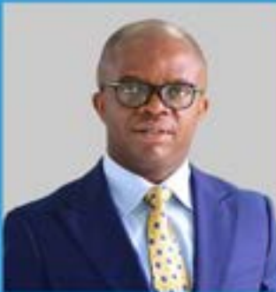
Hon. Dr. Stephen Amoah Deputy Minister (MP)