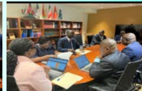
ACBF with support from the Bill and Melinda Gate Foundation has initiated a Public Financial Management (PFM) Training Programme in five countries, Ghana, Nigeria, Zimbabwe, Kenya and Senegal.