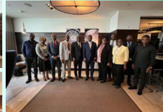
President of ECOWAS Bank pays courtesy call on Finance Minister in Washington