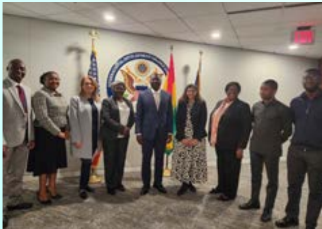
Ghanaian Delegation holds discussions with US International Development Finance Corporation (DFC).