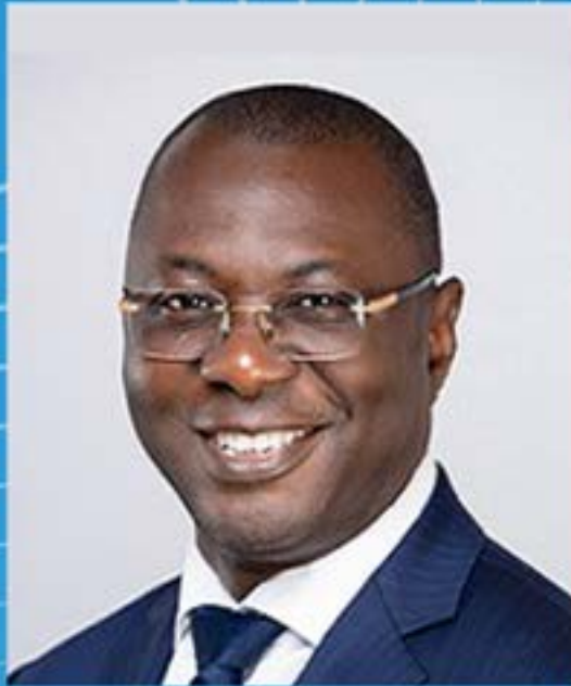
Hon. Mohammed Amin Adam Minister for Finance