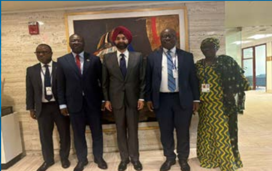
Meeting with World Bank President – Ajay Banga