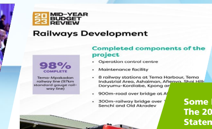
Some Infographics Of The 2023 Mid-Year Budget Statement