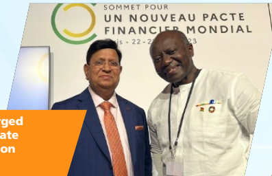
World Leaders urged to prioritise climate change, adaptation and mitigation