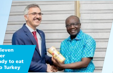
Ghana donates eleven (11) Twenty-Footer Containers of ready to eat cocoa products to Turkey