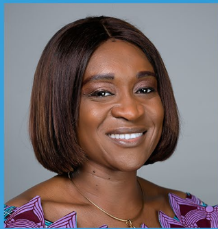
Hon. Abena Osei Asare Deputy Minister (MP)