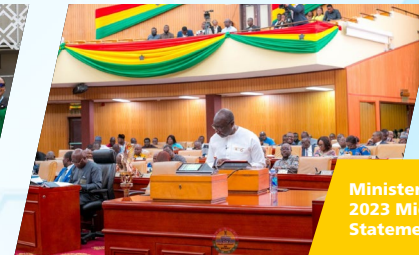
Minister For Finance Presents 2023 Mid-Year Budget Statement To Parliament