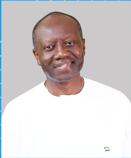
Hon. Ken Ofori-Atta Minister for Finance