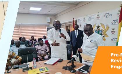
Pre-Midyear Budget Review Stakeholder Engagement