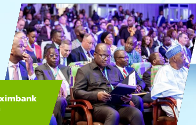
Ghana Hosts Afreximbank 30 th AGM in Accra