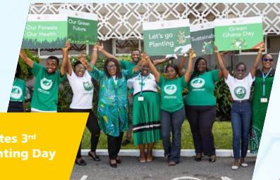
MoF commemorates 3 rd National Tree Planting Day