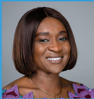
Hon. Abena Osei Asare Deputy Minister (MP)