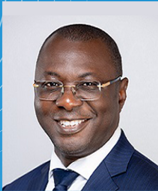
Hon. Mohammed Amin Adam Minister for Finance