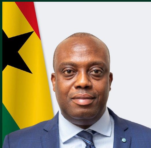
Hon. Thomas Ampam Nyarko Deputy Minister of Finance and MP for Asuogyaman