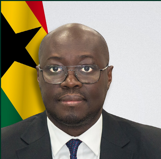
Hon. Dr. Cassiel Ato Baah Forson Minister for Finance and MP for Ajumako- Enyan-Esiam Constituency