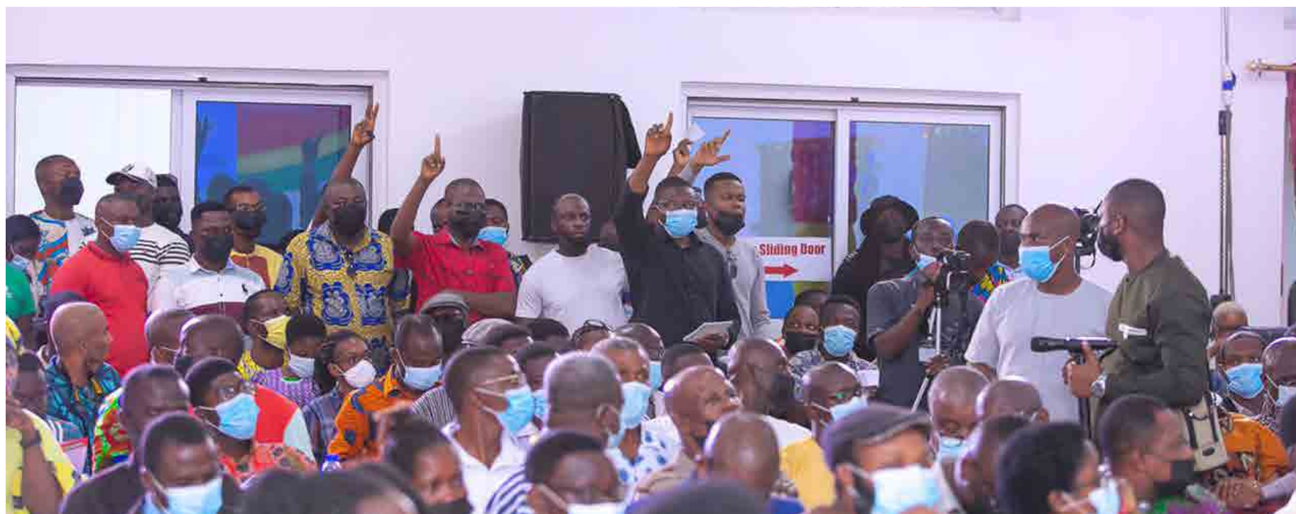
Government TownHall Meeting at Ho