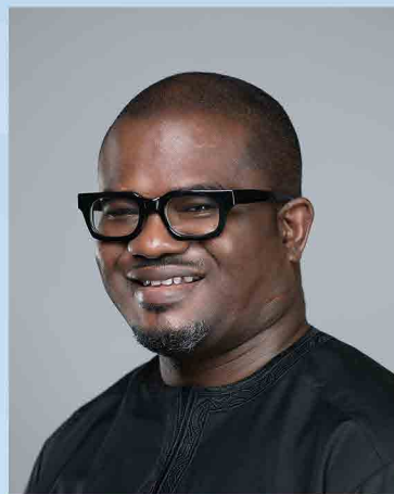
Hon. Charles Adu Boahen Minister of State, Finance