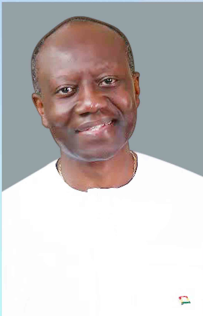
Hon. Ken Ofori-Atta Minister for Finance