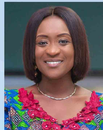
Hon. Abena Osei Asare Deputy Minister for Finance (MP)