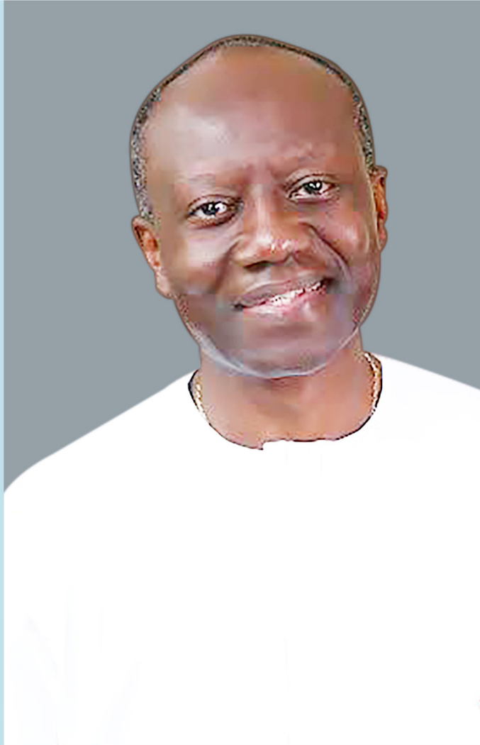
Hon. Ken Ofori-Atta Minister for Finance