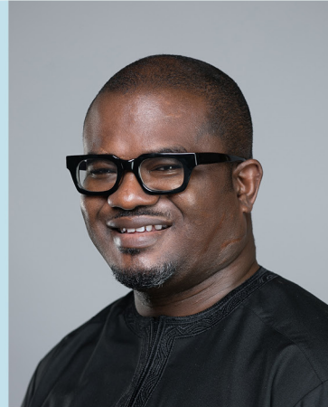
Hon. Charles Adu Boahen Minister of State, Finance