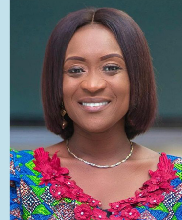
Hon. Abena Osei Asare Deputy Minister for Finance (MP)