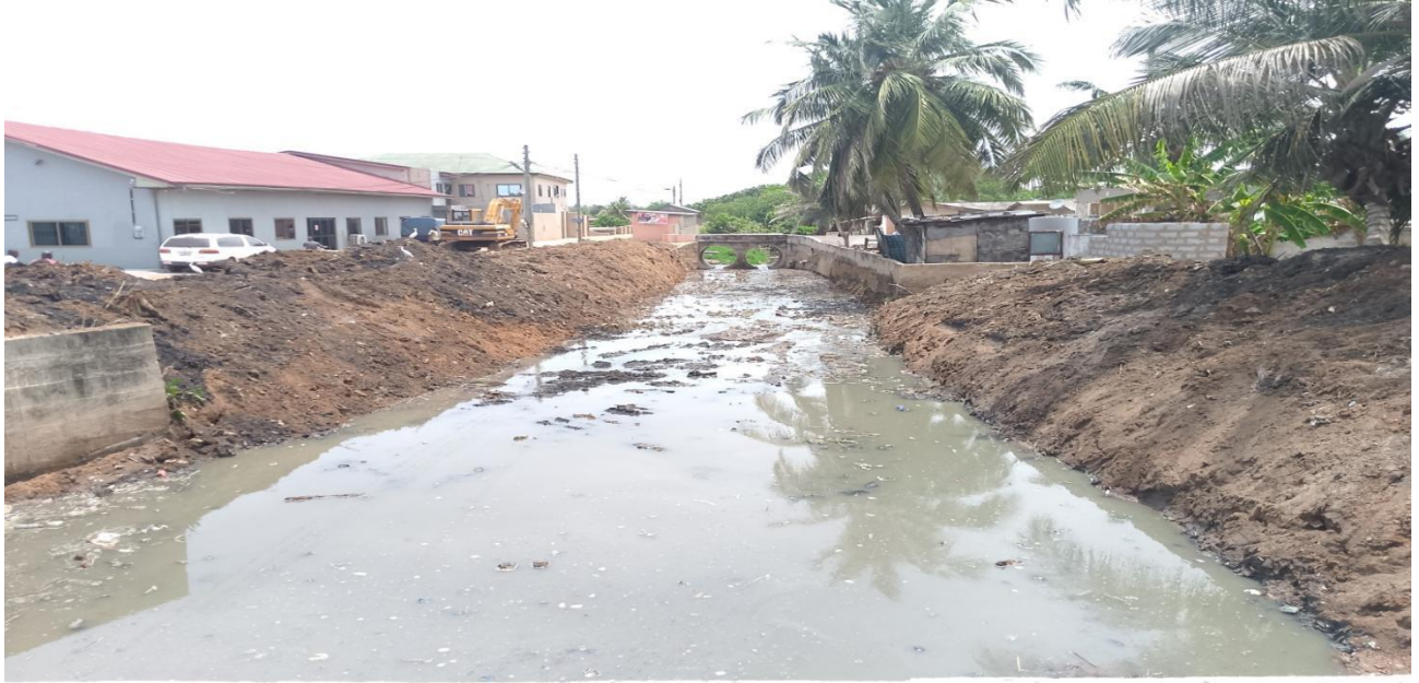
Dredging of Awikonaa from AG Church to Old Kasapreko (Before)