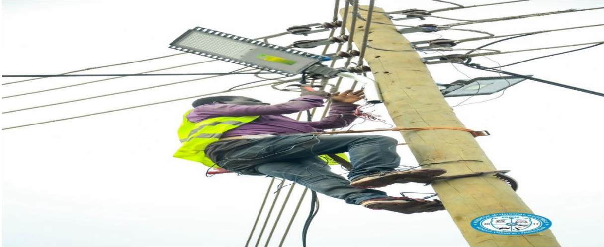
Installation of Streetlights