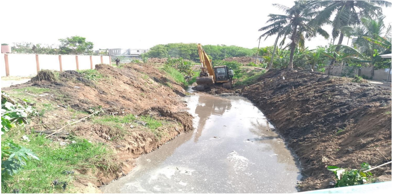
Dredging of Awikonaa from AG Church to Old Kasapreko (after)