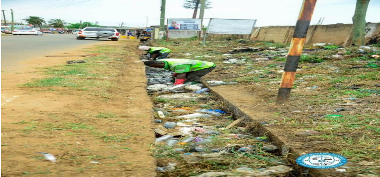
Desilting of drains in the Municipality