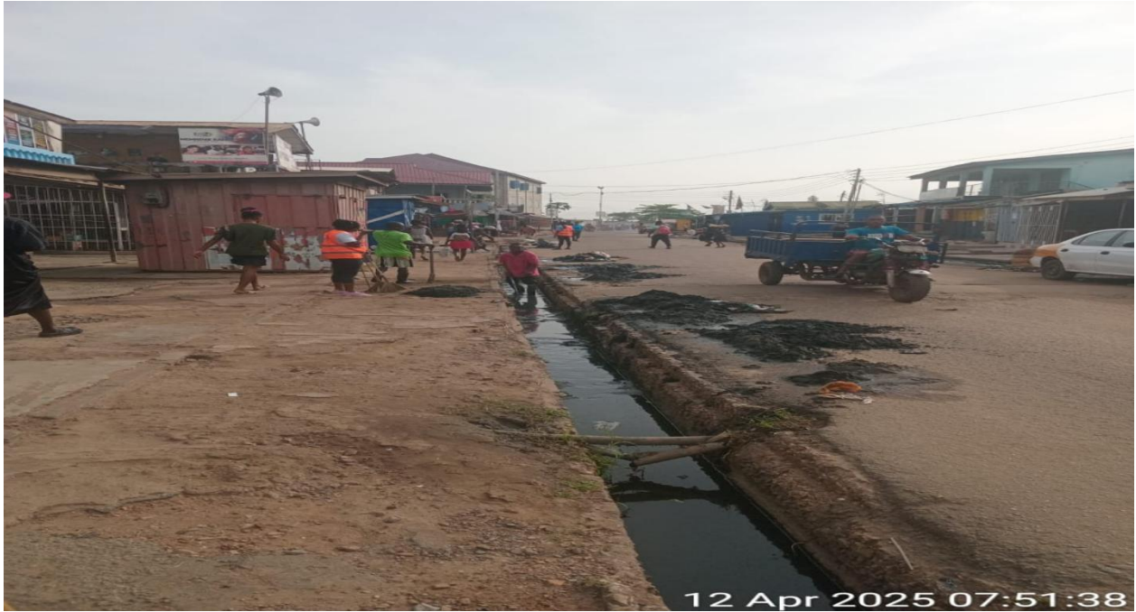
12 Apr 2025 07:51:38