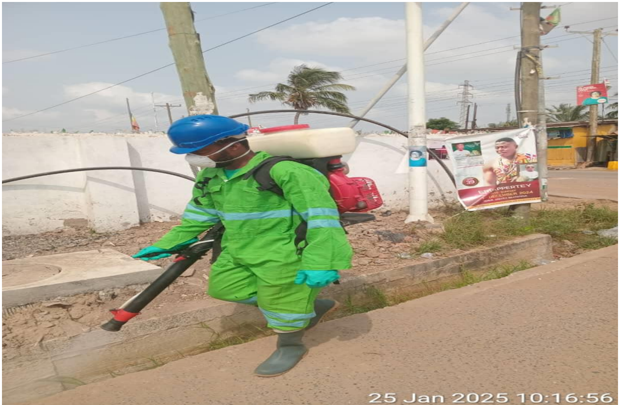
25 Jan 2025 10:16:56