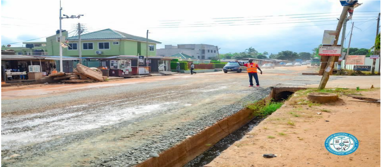
Dredging Works (Before dredging)