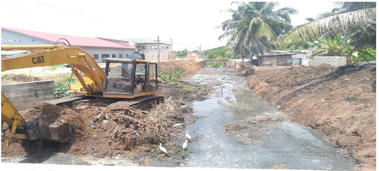
Dredging of Awikonaa (After)