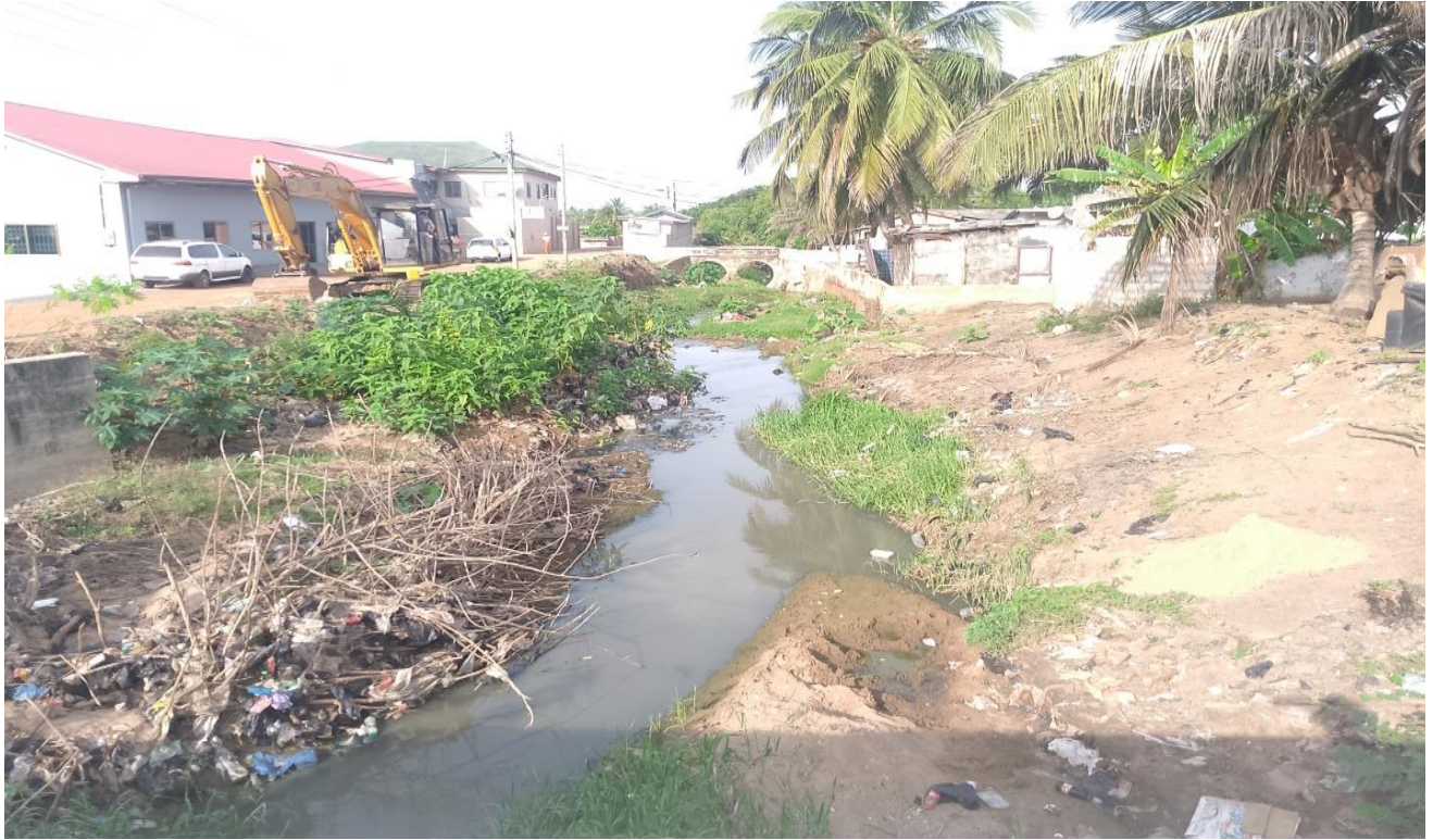
Dredging of Awikonaa (During)