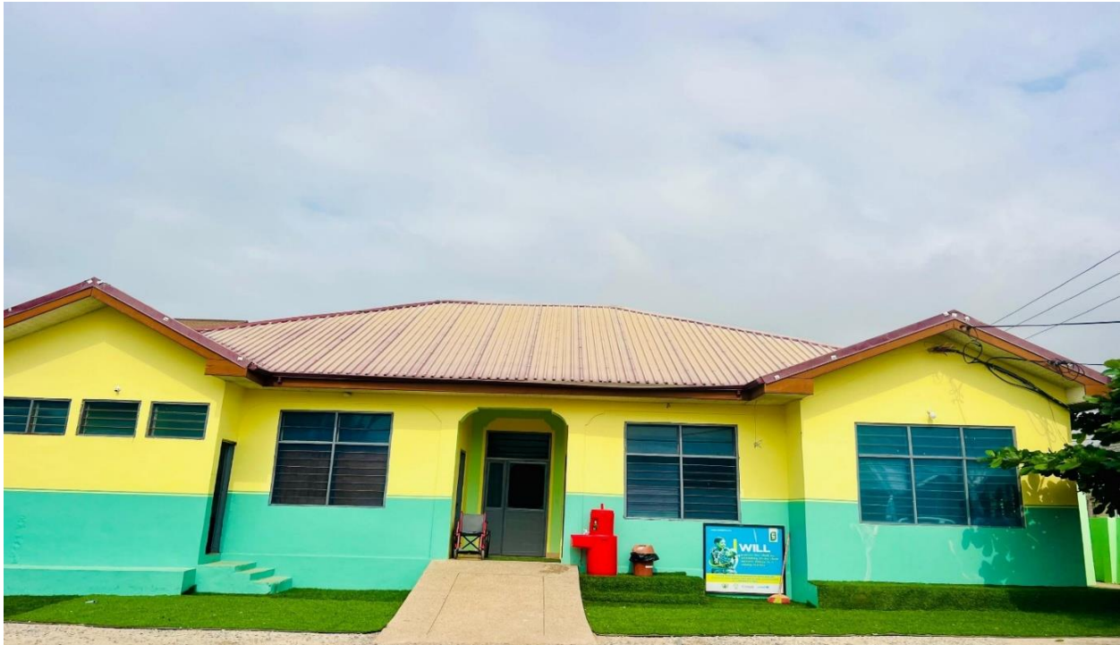
Nkpor Community Wellness Clinic