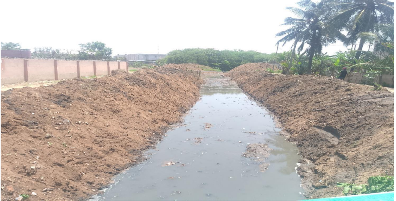
Grading and spot improvement Nii Bortei Doku Street and Boye Agbogla Street (Before, During and After)