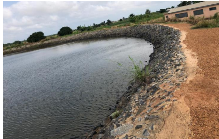
Procured and installed 1No. Submersible pump to a solar powered mini-irrigation dam at Angorsikope