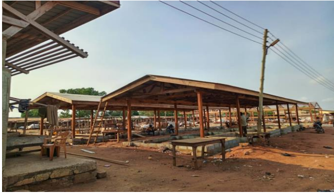
CONSTRUCTED 4NO. UNIT MARKET SHEDS HOUSE FACILITIES