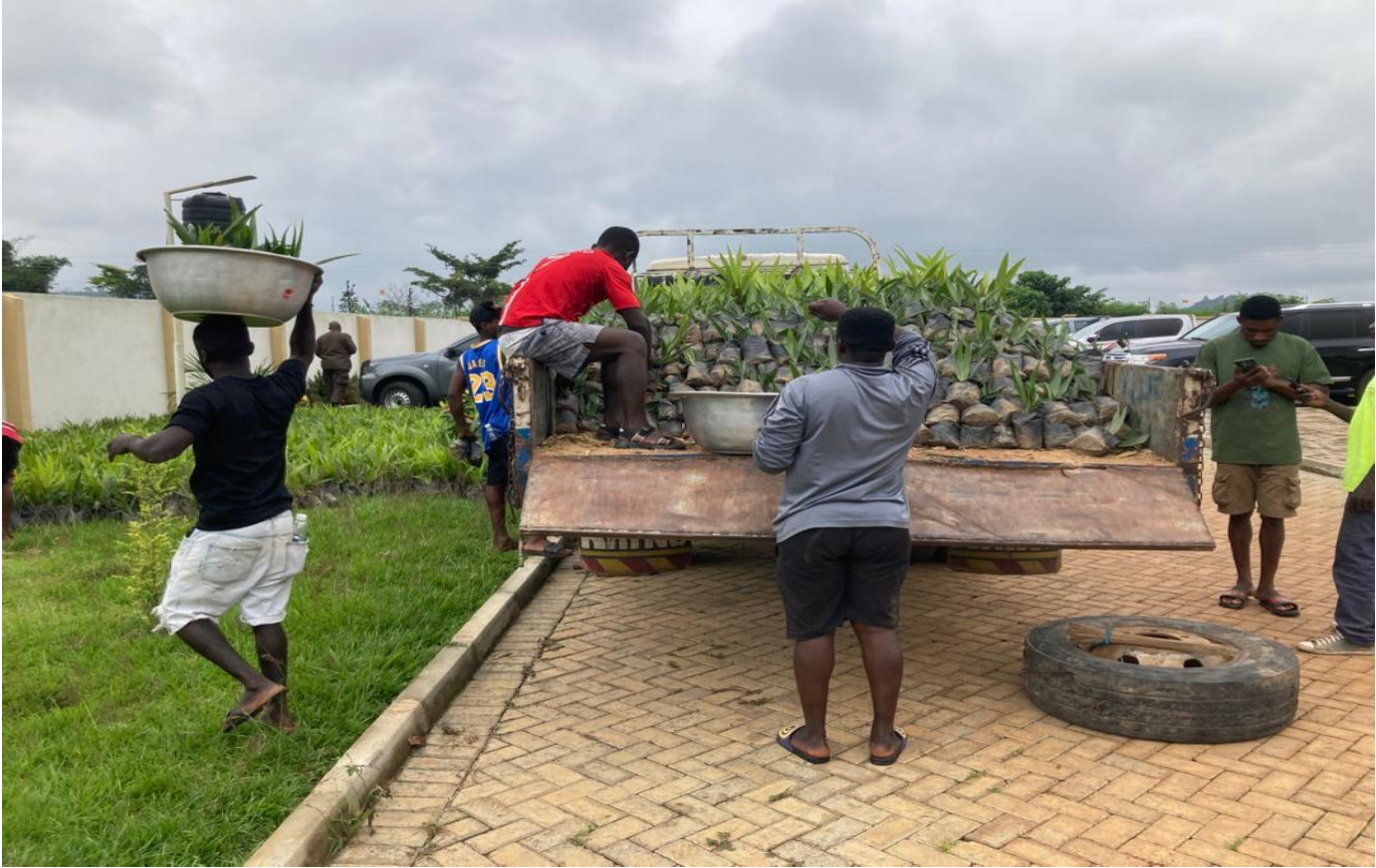
Adansi Asokwa District Assembly