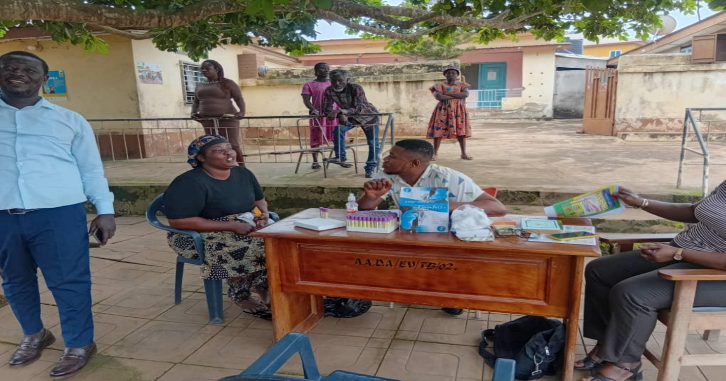
Adansi Asokwa District Assembly